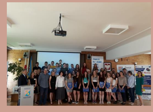
REGIONALNE CENTRUM EDUKACJI ZAWODOWEJ -POLAND