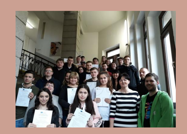
STREDNI ODBORNA SKOLA OBCHODU, UZITEHO UMENI A DESIGNU - CZECH REPUBLIC