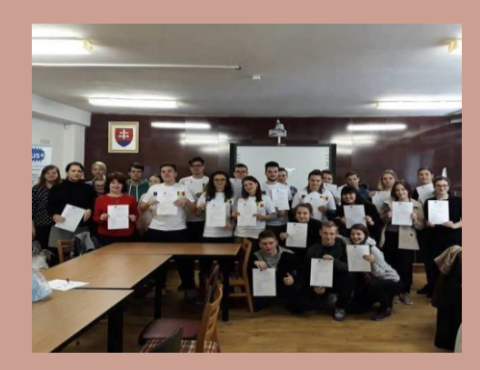
SPOJENA SKOLA DETVA- SLOVAKIA