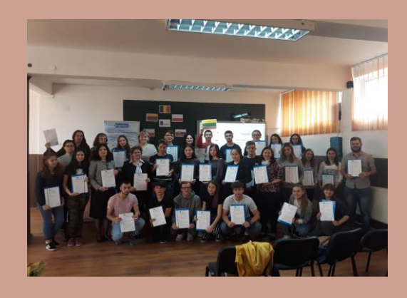
TECHNICAL HIGHSCHOOL NO.1 BALS, ROMANIA