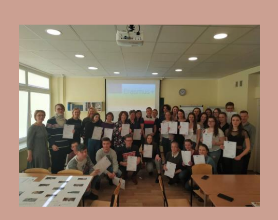
VILNIAUS TURIZMO IR PREKYBOS VERSLO MOKYKLA-LITHUANIA