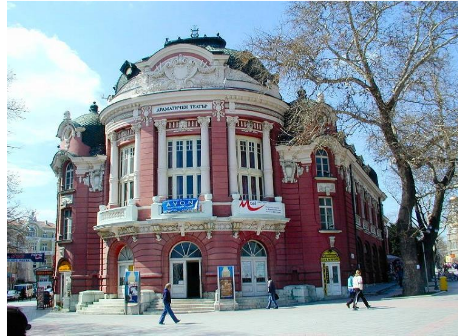
Theater Stoyan Bachvarov