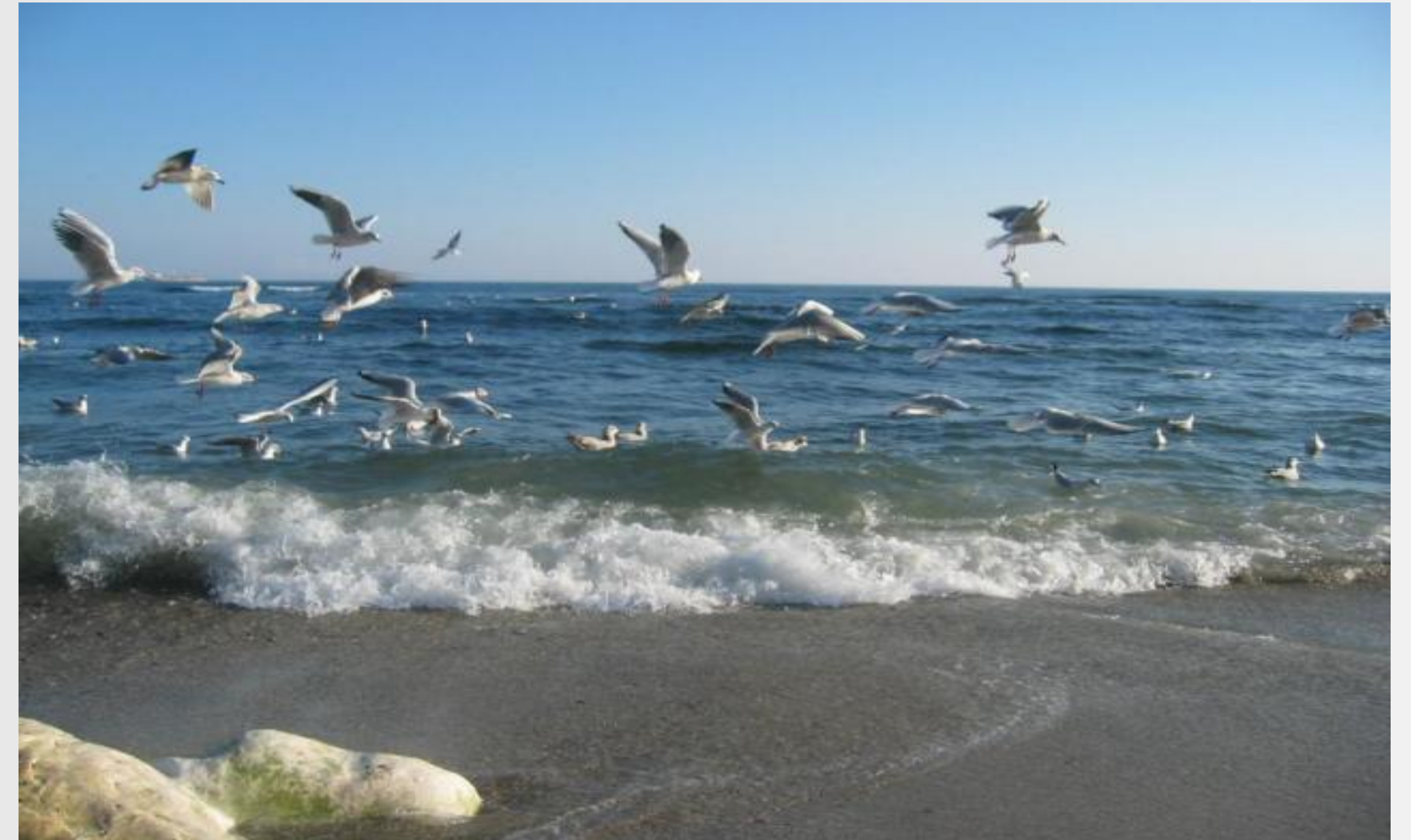
Varna, Black sea