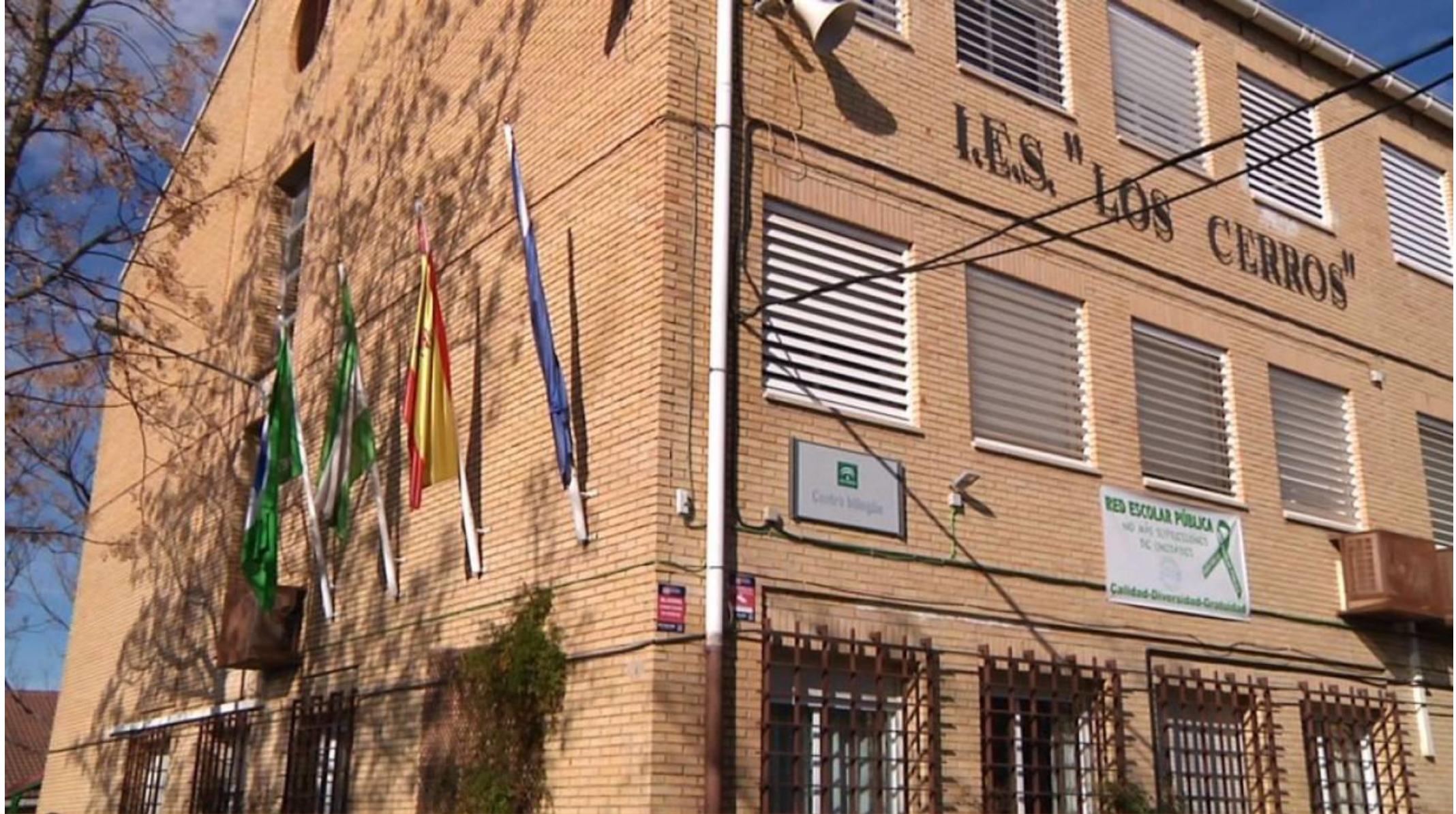
Our School "IES Los Cerros"