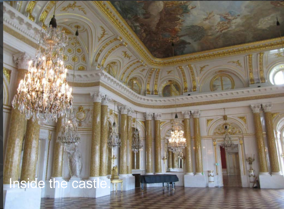
Inside the castle.