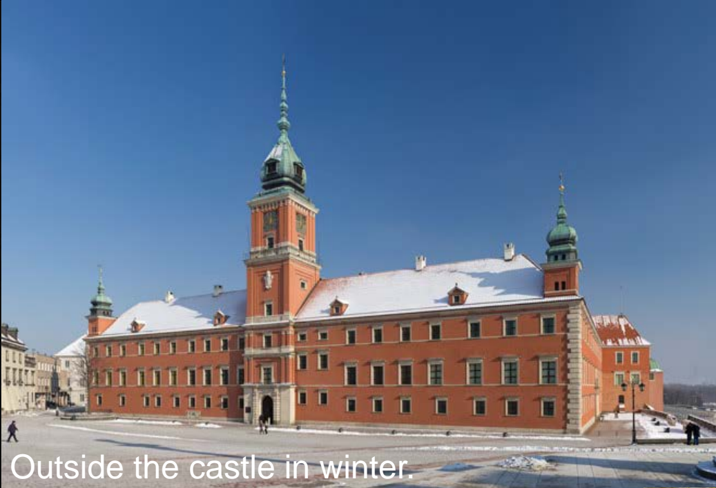
Outside the castle in winter.