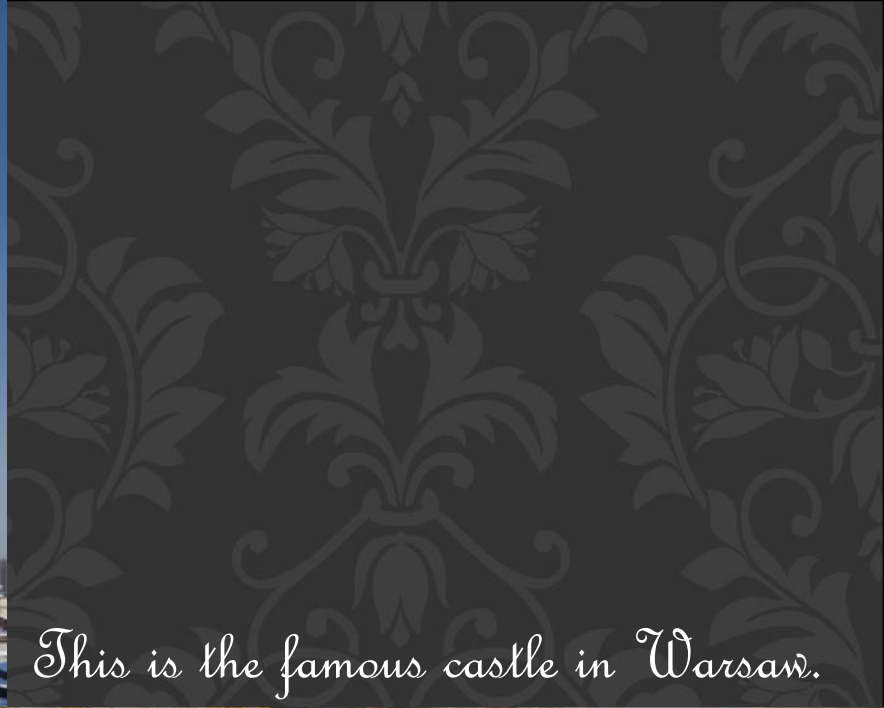
This is the famous castle in Warsaw.