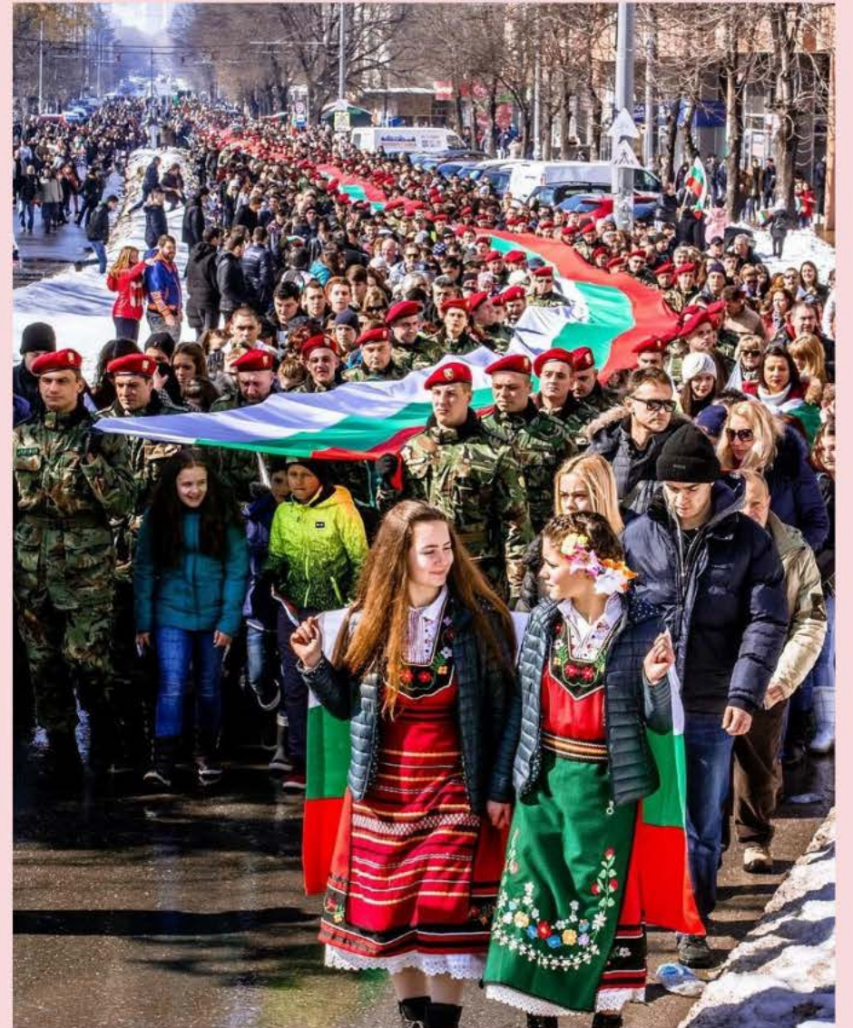
National Day Of Bulgaria