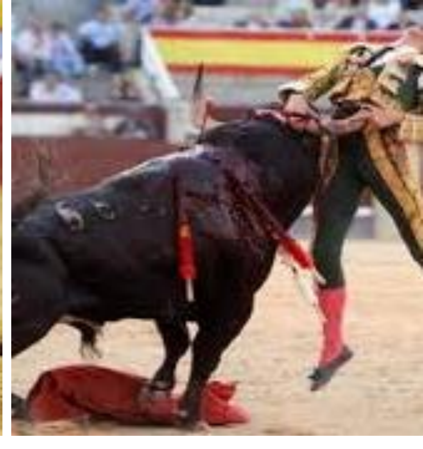
Fighting a bull