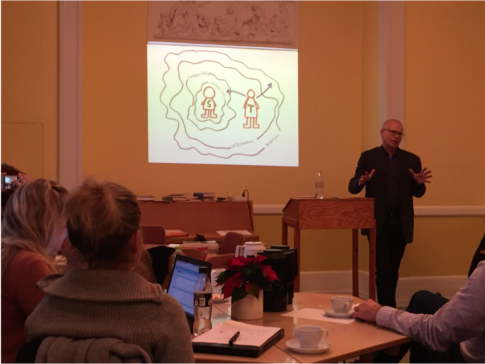
The student and the teacher “respect in the relationship”