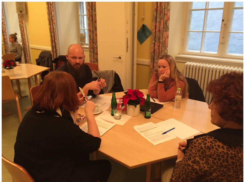
Group work session