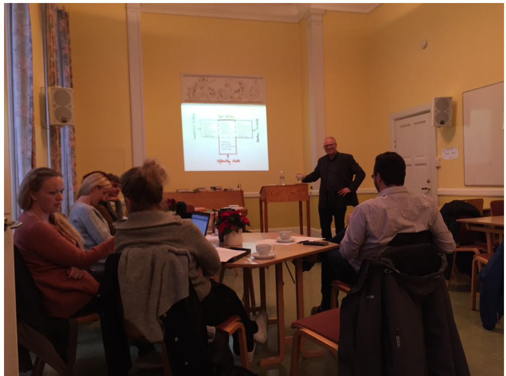
Lecture of the illustration of schools areas