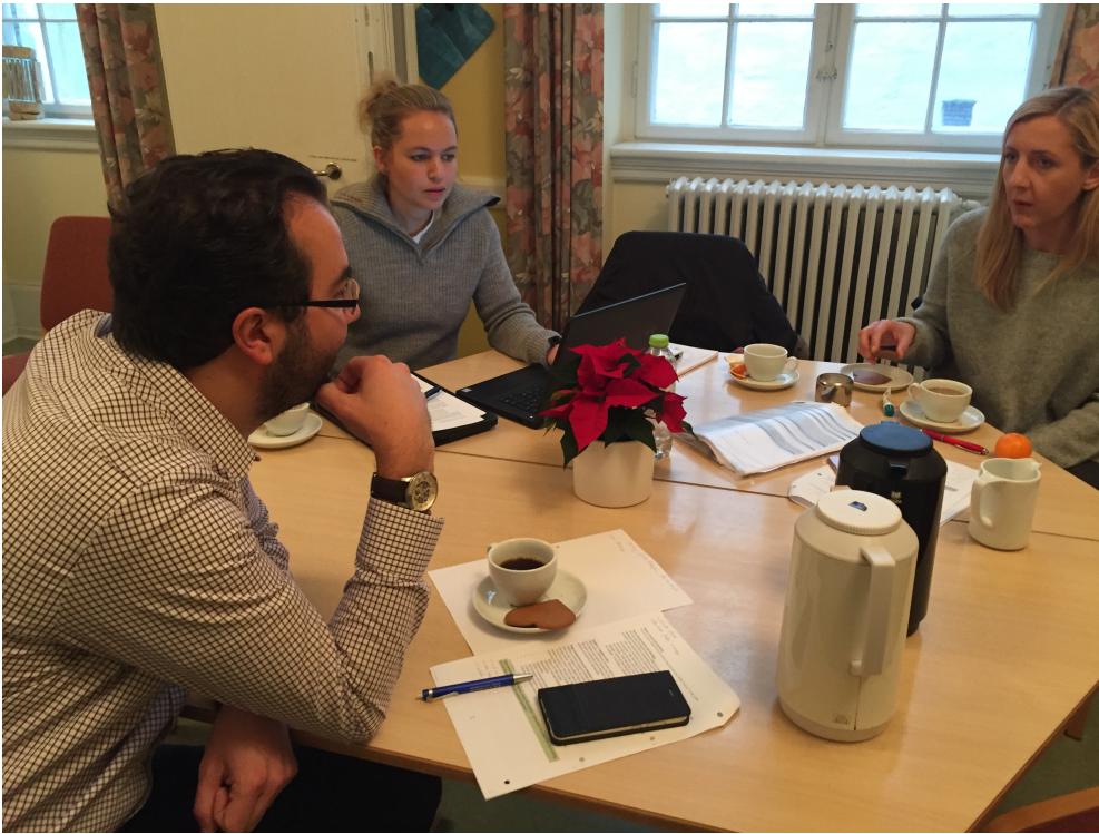
Group work session