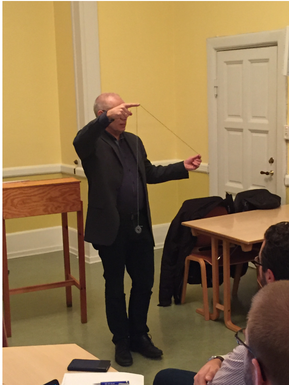
Illustration of the fundament of Education