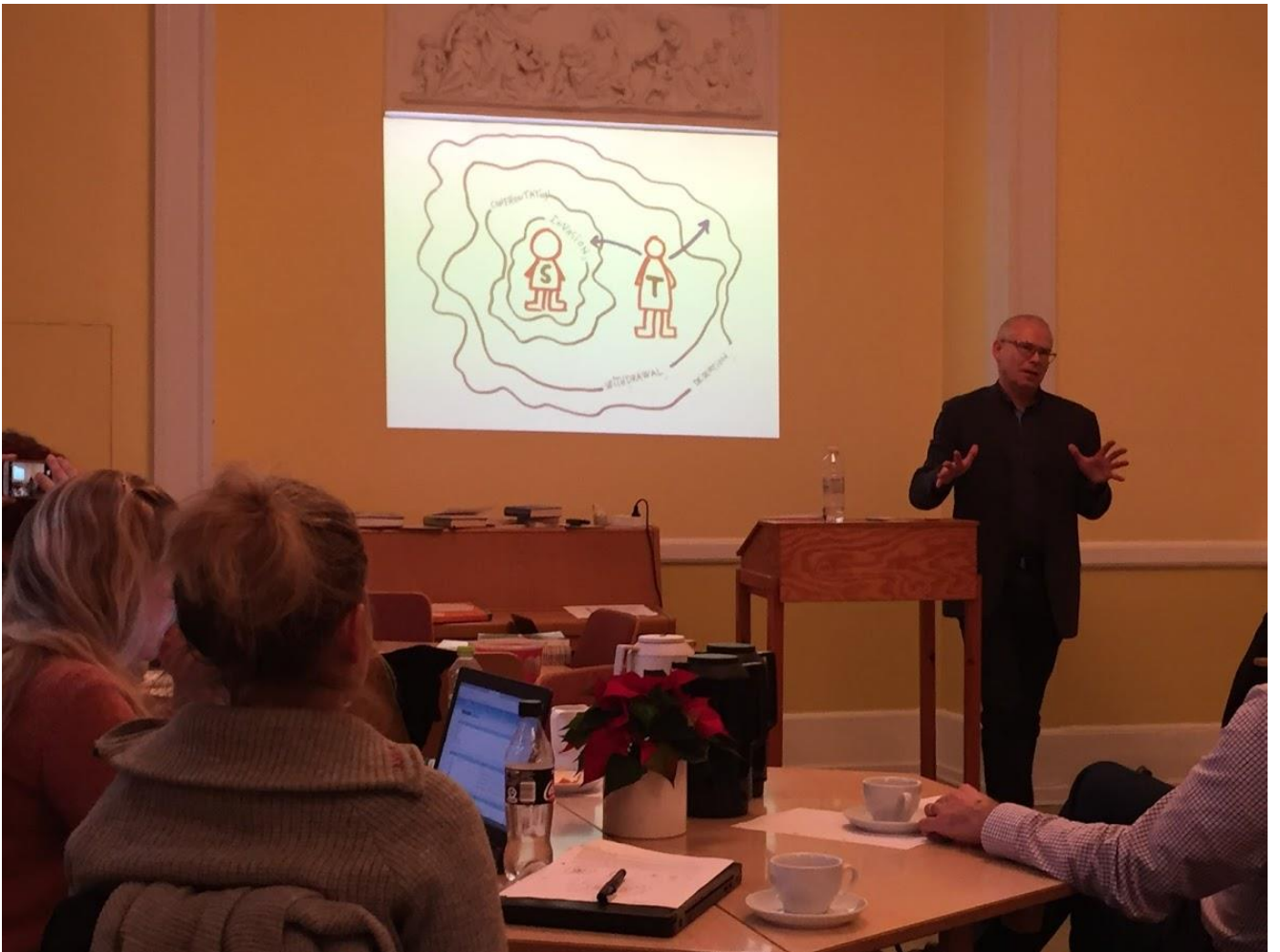
Lecture and discussion