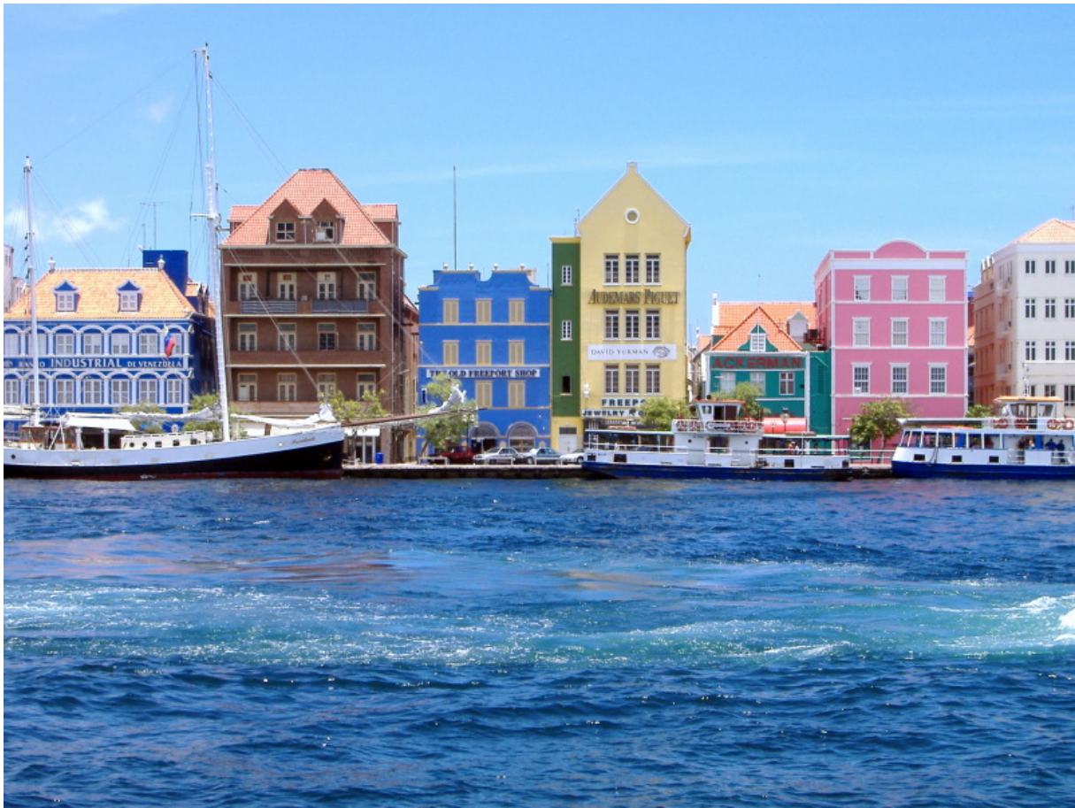
Tera Corá, Westpunt, Willemstad , Sint Michiel

This town is characterised by a mix of architectural styles and Caribbean colours. Its island is part of the Kingdom of the Netherlands. There are many Dutch influences, but also Spanish and Portuguese. The historic town centre has been a World Heritage site since 1997. What is the name of this town?