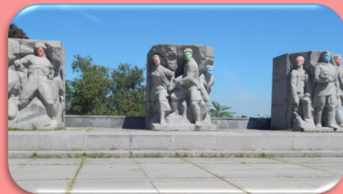
Monument of resistance