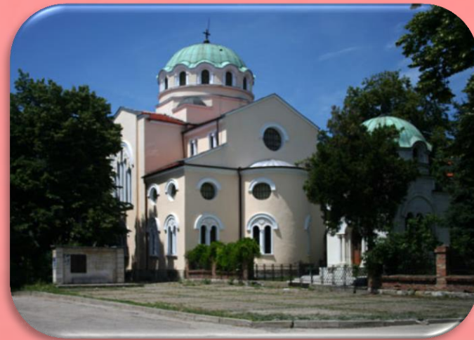
"St. Nicholas" Church