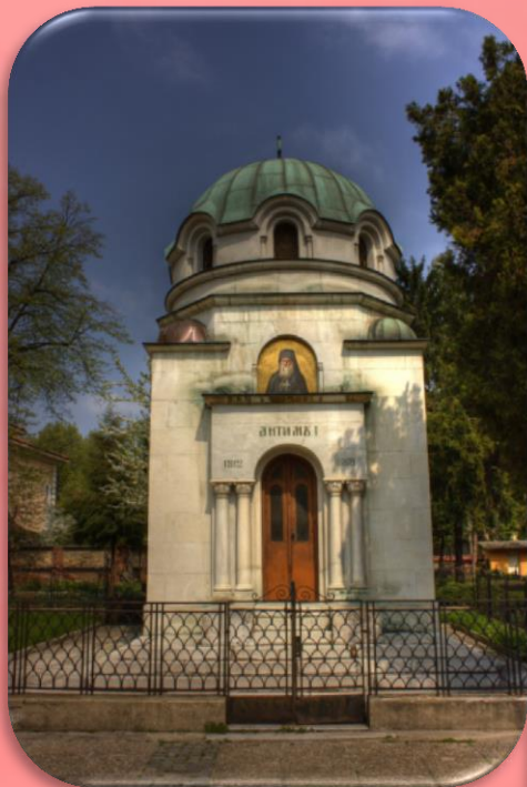
Mausoleum of "Exarch Antim I"