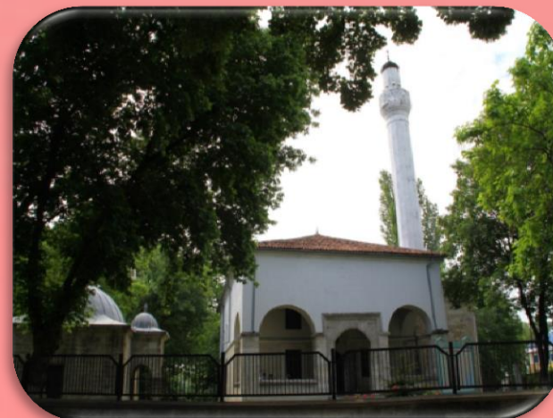
Mosque and library of "Osman Pazvantoglu"