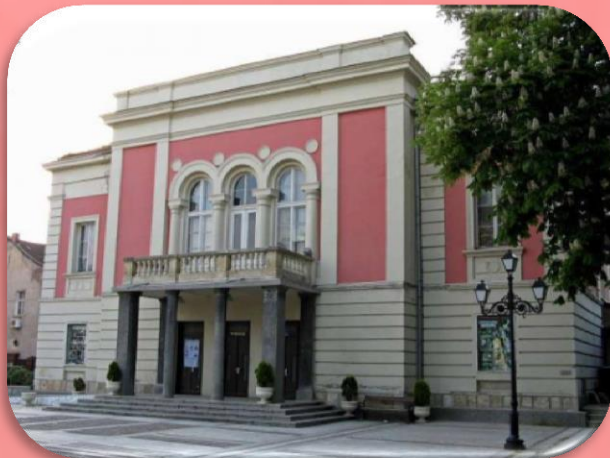
Municipal Theatre "Vida"