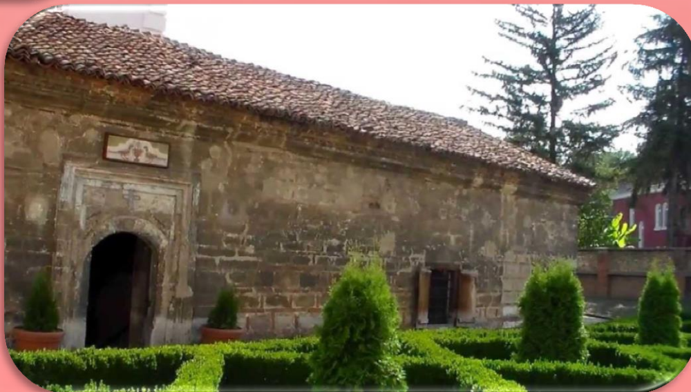
Church " St. Panteylemon "