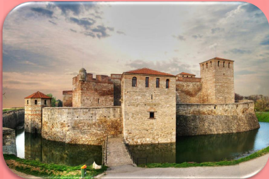
Fortress "Baba Vida"