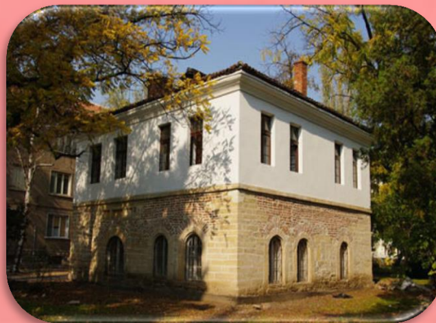
Turkish post office