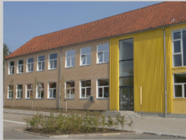
school in Denmark

The Utopia school is 2 or 3 floor high, modern and colourful. The classrooms are rather cosy, white or yellow with huge windows. On the walls, there are students' pictures