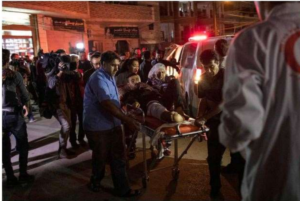
Wounded people arriving Sunday at a Kurdish-run hospital in Qamishli.