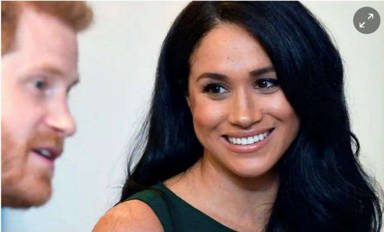
▲ The Duke and Duchess of Sussex. Meghan said the past year had been difficult.