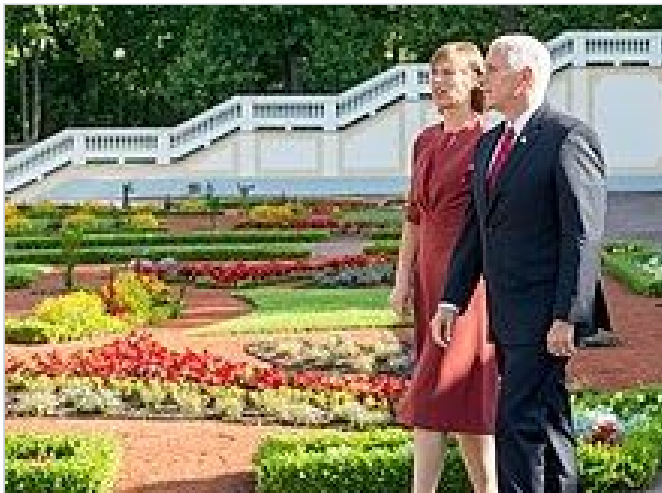
Kaljulaid with Mike Pence in July 2017

On 19 September 2016, the freshly founded Development Monitoring Advisory Board at the Chancellery of Estonian Parliament voted Kaljulaid to be its chair