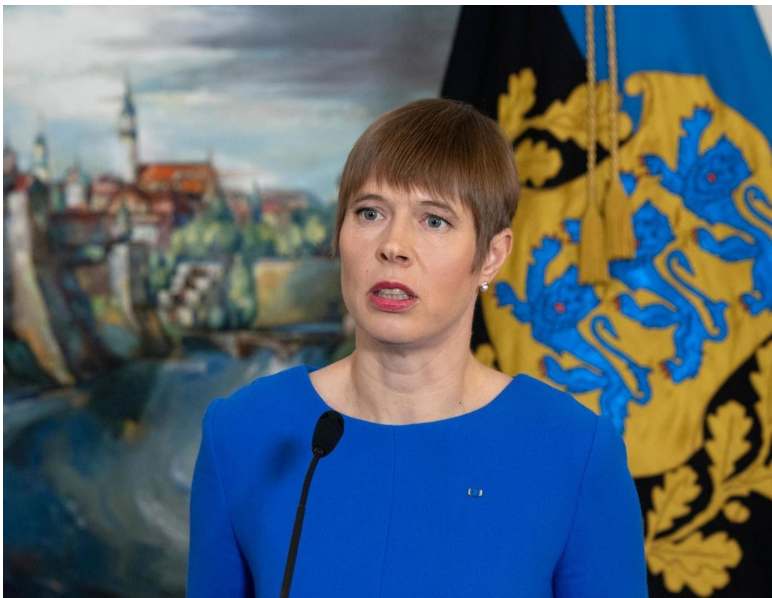
President of Estonia Kersti Kaljulaid 2

In 2017, she became the first Estonian to be featured in the Forbes magazine's list of The World's 100 Most Powerful Women , placed at 78th and came twenty second among the most influential female political leaders.