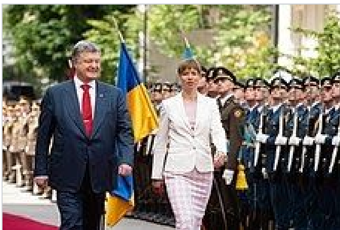
Kaljulaid with Petro Poroshenko in May 2018