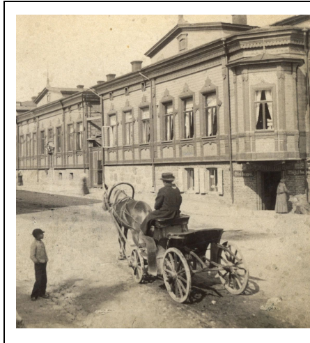
Kuopio in 18th century

As a young girl, Minna lived in Kuopio and Tampere. In Jyväskylä she married Johan Ferdinand Canth. Johan was the teacher of the Minna. Johan worked as a male teacher in Jyväskylä in the 1878s.