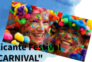
Alicante Festival "CARNIVAL"