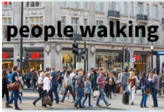
people walking freely