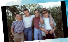
spending time with