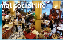
normal social life