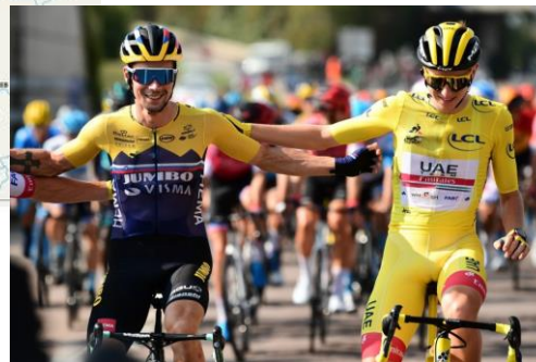
Primož Roglič and Tadej Pogačar