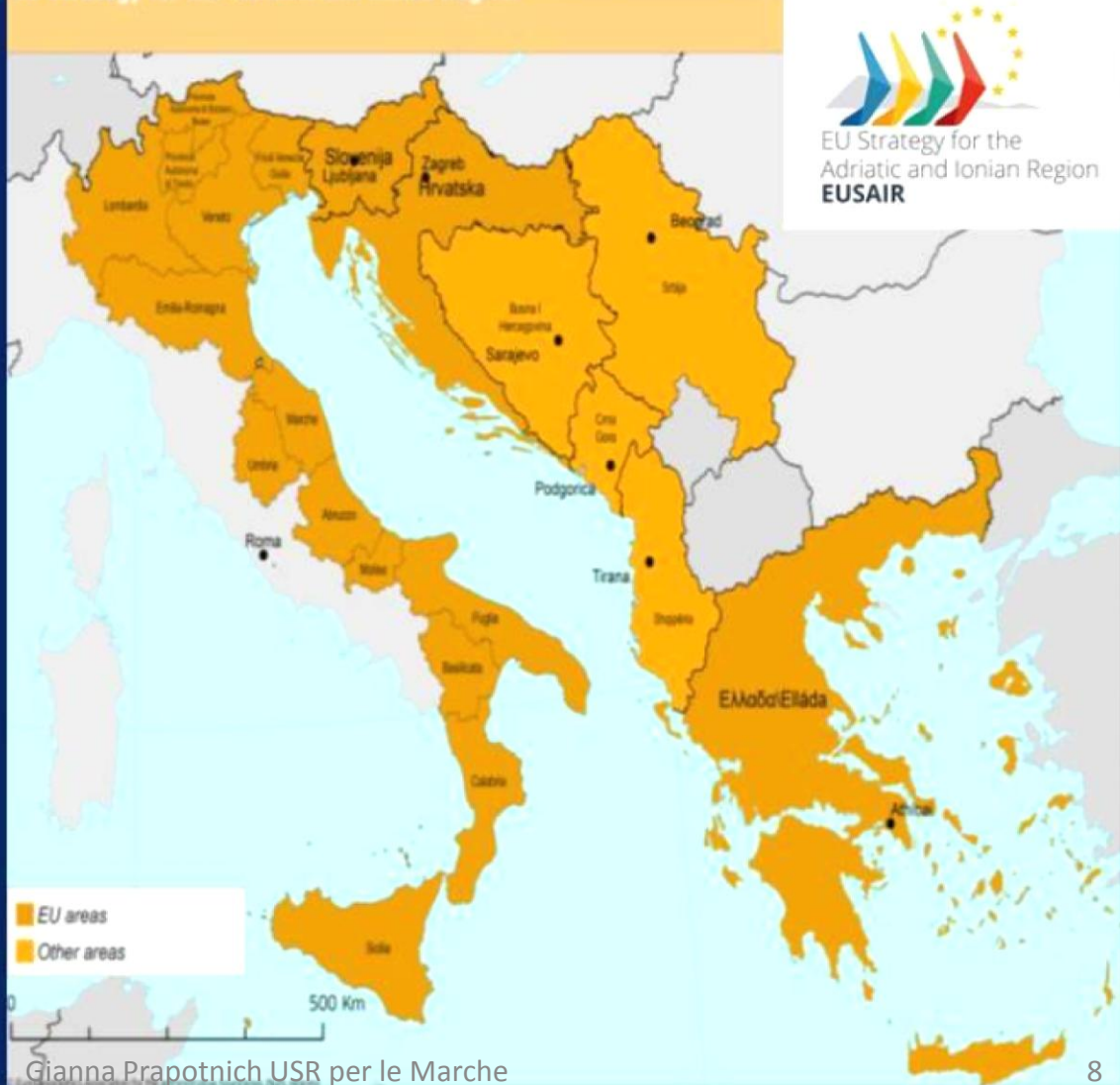
EU Strategy for the Adriatic and Ionian Region

Fondamentali i finanziamenti e la governance: EUSAIR priorità nel piano di investimenti per la crescita e lo sviluppo annunciati dal Presidente UE Juncker (300 miliardi di Euro).