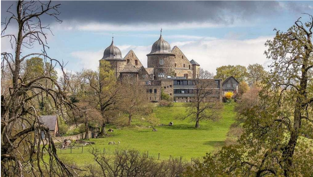
(Sleeping Beauty's Castle: Dornröschenschloß Sababurg)

Finally, some impressions of our home: GRIMM HEIMAT NORDHESSEN and our questions... We hope you like them.