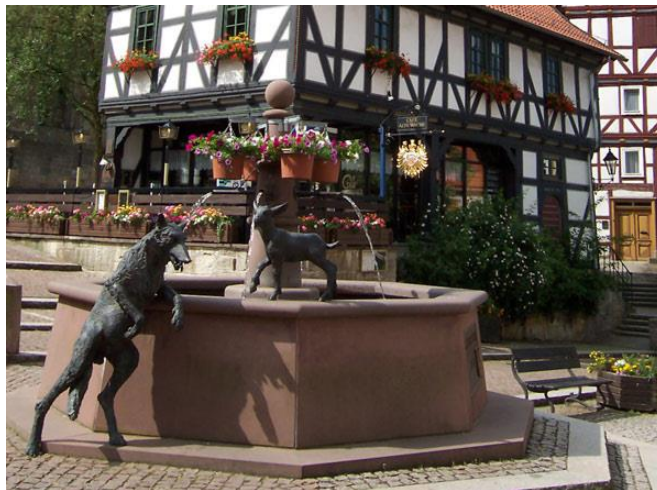
(Fairy Tale Well: Märchenbrunnen in Wolfhagen)