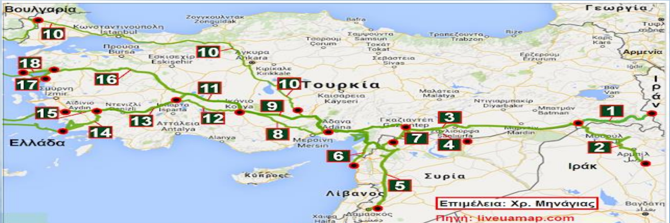
Χάρτης Μεταναστευτικών Διαδρομών στην Τουρκία