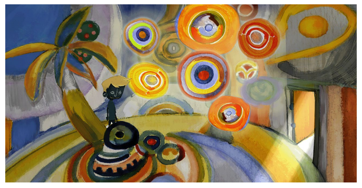
Nubla Art Game

Another project worth mentioning is Nubla, begun in 2018 from the education department of the Thyssen-Bornemisza Museum of Madrid. Thanks to the support of a development company (Gammera Nest), another devoted to video games (Sony Spain) and the museum staff, a group of young people have been able to thoroughly familiarize themselves with the collections to contribute a personal interpretation of the art. This is a means of encounter, co-creation and learning that has given rise to a multidisciplinary team of artists, cultural managers, philosophers, programmers, designers, musicians, etc., who have created three games: Nubla 1, "El mundo de Nubla" (World of Nubla) and Nubla 2. The adventure began in 2016 with a workshop entitled Nubla Art Game, with a view to developing a critical, constructive outlook on artistic creation. Another outcome of that workshop was creation of a video game. Starting in 2018, the program "Open Tuesdays" was consolidated, featuring weekly meetings of young people from diverse backgrounds, to share and work together on production of the video game. At the end of that year, they began to offer guided visits to adults and young people (from 15 to 25) to discuss how the different works of the museum had influenced the creation of the video game. Nubla 2 was presented.