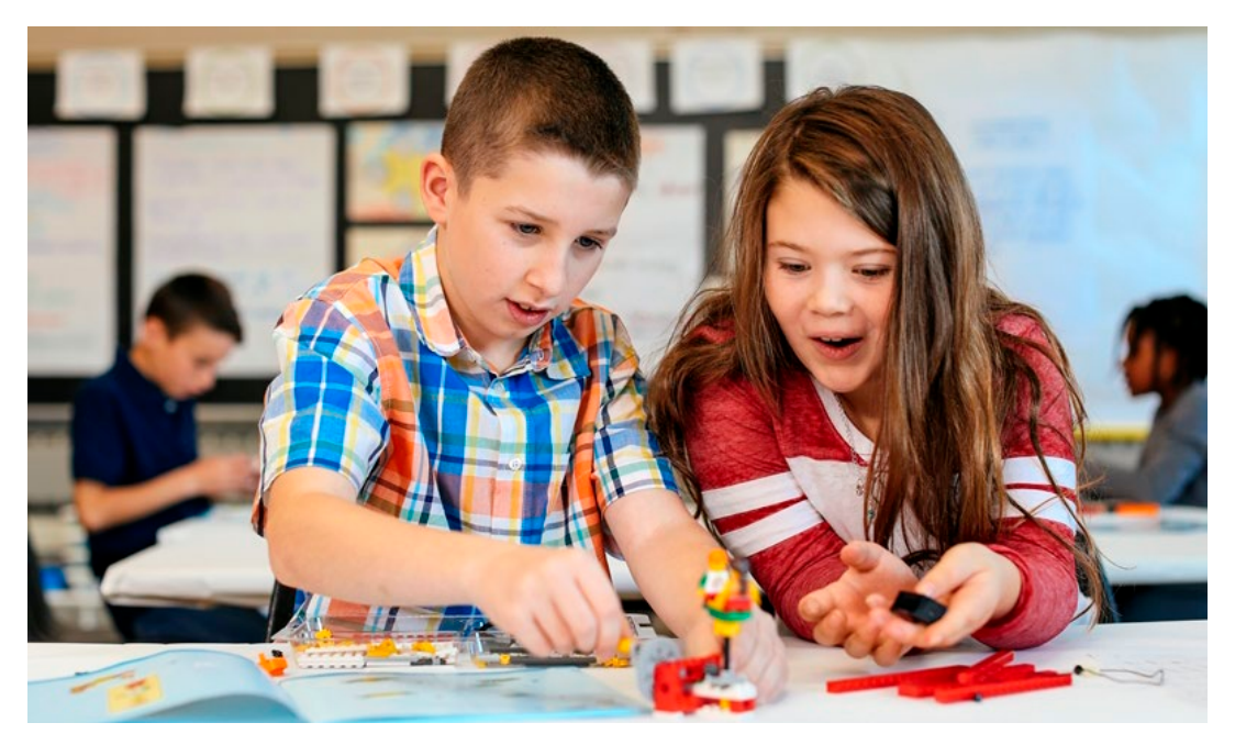
Lego Education Robotix at the Museu Marítim de Barcelona.

STEAM has also been present at the <u>Museu Marítim de Barcelona</u> since 2019 thanks to the support of Lego Education Robotix. In this case, the museum proposes three activities for school groups ('Izad velas' [Raise Your Sails] for pre-schoolers, 'Matemáticas, un mundo de máquinas' [Mathematics, a World of Machines] for primary and 'La Mar de Ingenio' [Sea of Ingenuity] for secondary school students) in which their curiosity, the exchange of ideas, teamwork, creativity and experimentation are encouraged through a number of trial-and-error processes. These are proposals in which students are free to experiment and explore as they acquire new knowledge by cooperating in open tasks.