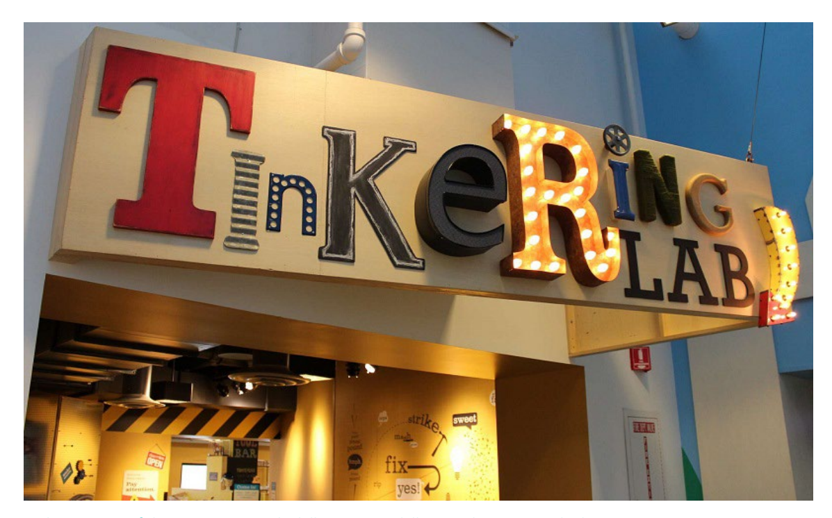
Tinkering-zone of the Museo Nazionale della Scienza e della Tecnologia Leonardo da Vinci

There are numerous museums that have already applied STEAM in their programs and spaces<sup>2</sup>. First, mention can be made of the Tinkering-zone of the Museo Nazionale della Scienza e della Tecnologia Leonardo da Vinci di Milano, a new permanent space opened in 2014 as an interactive laboratory devoted to production, engineering and design in order to develop an innovative educational program based on creativity. The space is geared to children eight years and up as well as adults, and is based on working in groups to explore and understand science and technology. The activities are proposed around the Inspiration Box, an area where the creations of visitors, artists or designers who have worked there are put on display. The entire project revolves around creative reuse and sustainability, but an effort is also made to generate a domestic, familiar atmosphere. All proposed activities are accessible without prior reservation. There is no fixed opening time.