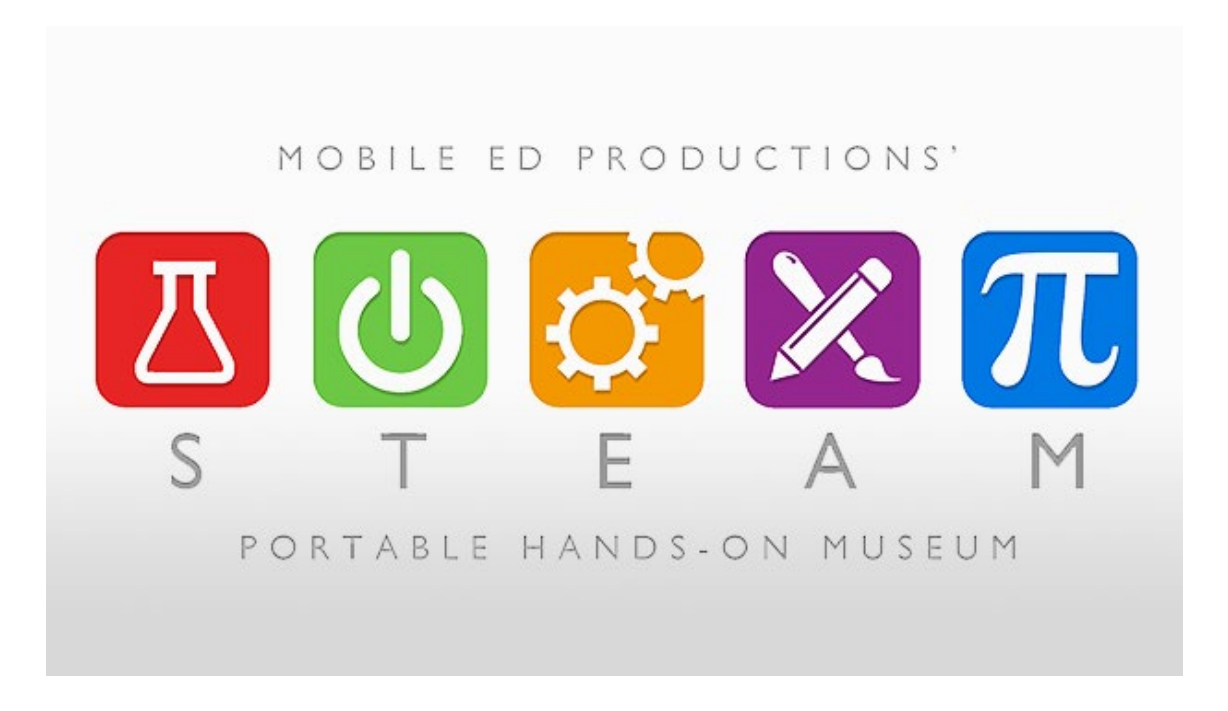
Portable Hands-On Museum - Mobile ED productions, Inc.

Educational undertakings of the 21st century must turn students into the leading players of their own learning process. To achieve this aim, teachers have to be capable of seeking out new methods, tools and spaces that contribute to meaningful learning. This will require life-long, multidisciplinary training. It no longer makes much sense to speak in terms of syllabi or subjects. The future is in project-based learning, mutual collaboration among different areas, and placing students' interests in the centre of learning. This way, an educational project based on the interrelation of concepts, subjects and knowledge that can be applied in real situations gives rise to a form of learning based on experimentation and the senses.