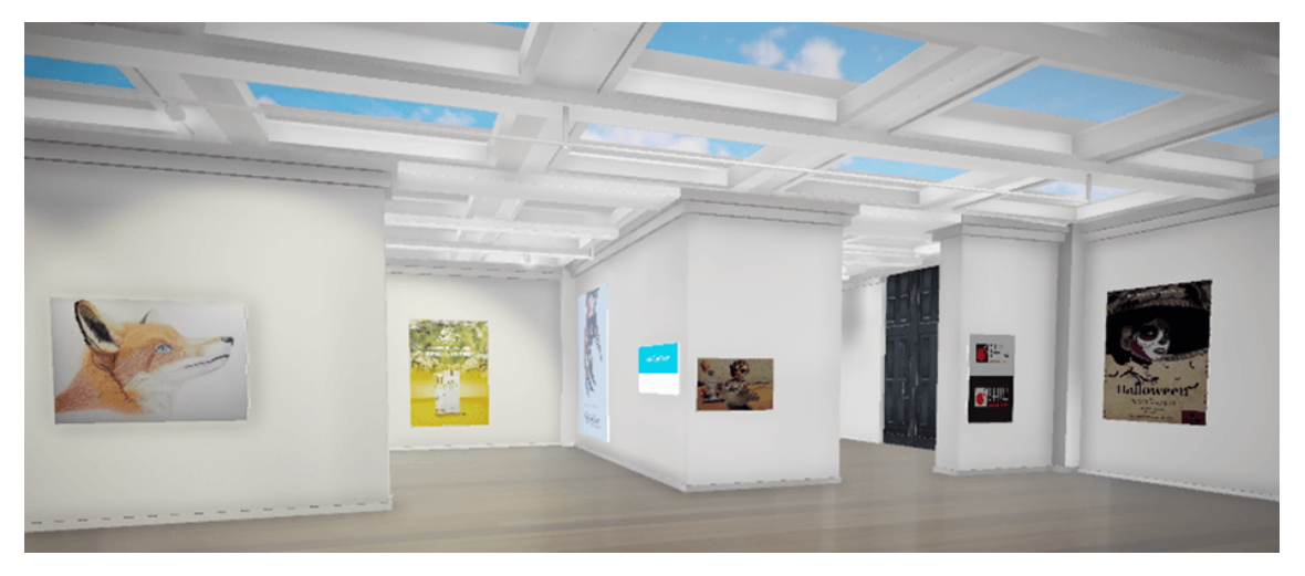
Museo Virtual ESIT.

Around the same time, STEAM was progressively implemented in on-line learning environments. One example of this is the <u>Museo Virtual ESIT</u>, promoted by the UNIR (the Online University) in 2018, an interactive educational innovation project that is accessible through an interactive interface. Its main goal is to facilitate the publicity of projects carried out by design students, generating a virtual museum that became a platform of discussion and dialog.