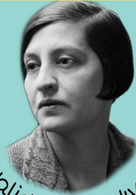
Halide Edip Adivar