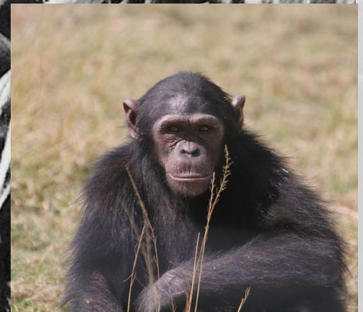
Jane Goodall's research was about the apes.

a substance that would help the creation of the atomic bomb.