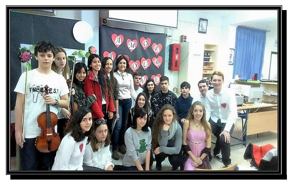
Students and teachers interpret literature and music