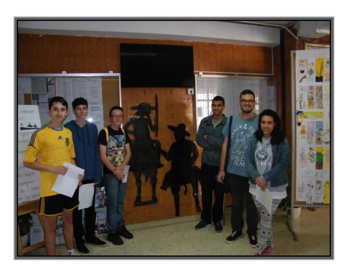
Reading in different native languages by Students and teachers