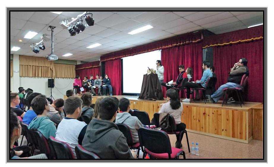
Uninterrupted reading during all the morning