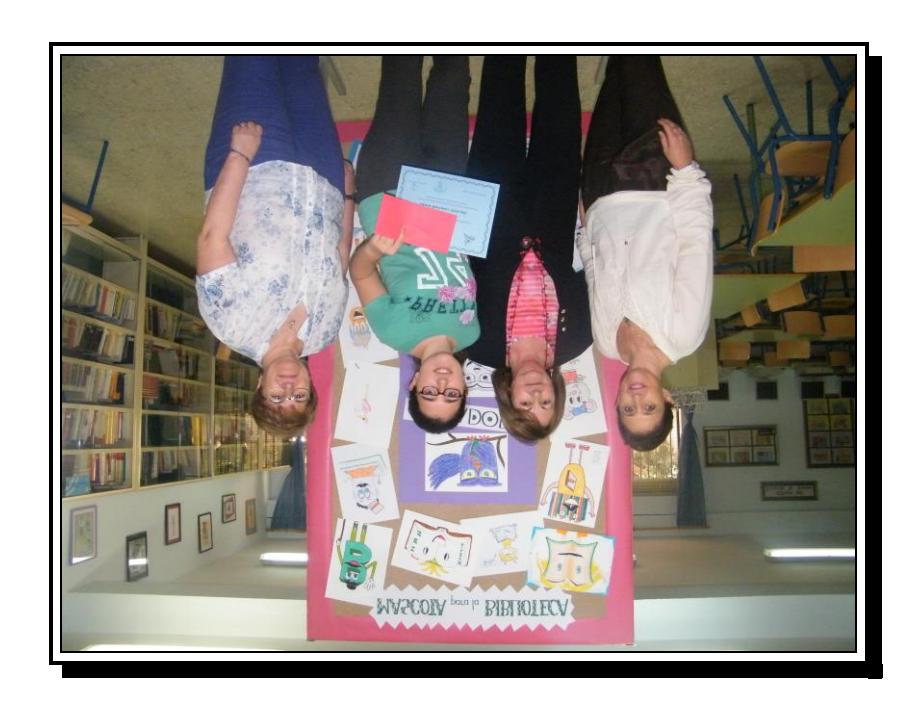
Looking for a mascot for The Library