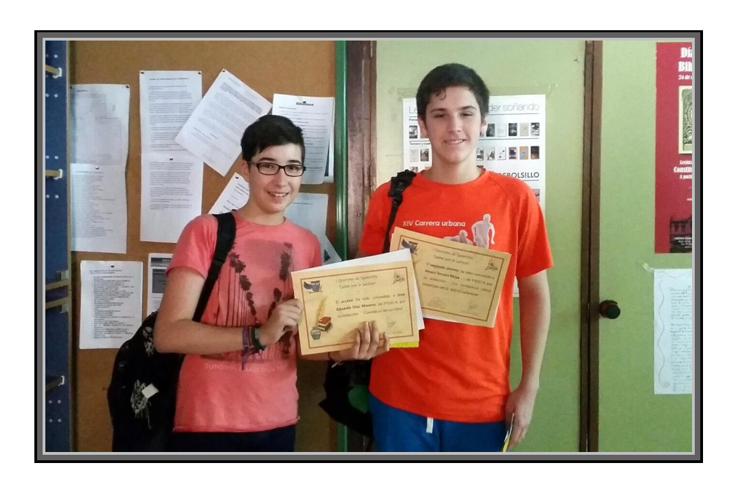
Essay contest winners