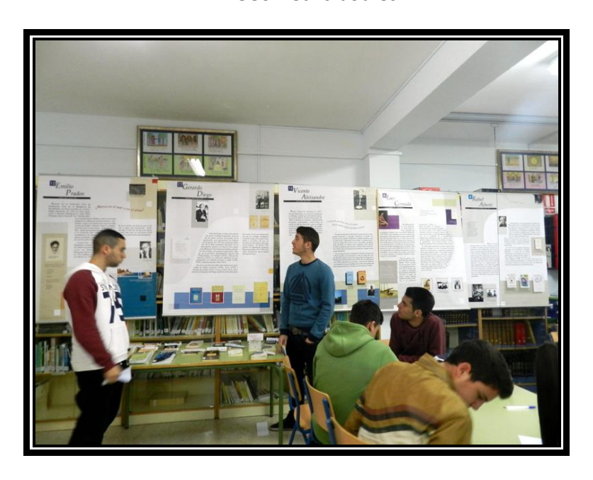
"Exhibition Generation 27"

This work is licensed under the Creative Commons Attribution-NonCommercial-ShareAlike 4.0 International License. To view a copy of this license, visit <a href="http://creativecommons.org/licenses/by-nc-sa/4.0/">http://creativecommons.org/licenses/by-nc-sa/4.0/</a>.