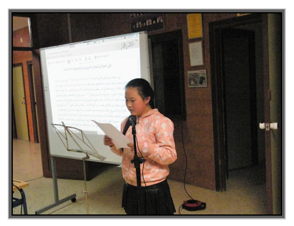
A student reading in Chinese