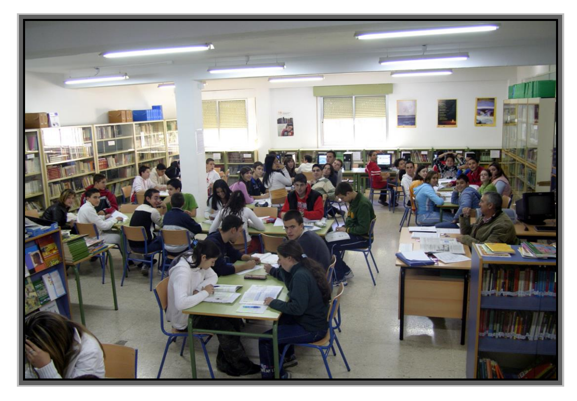
The Library before 2011