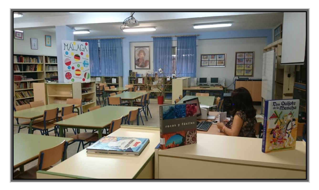
The Library today