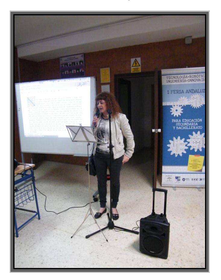
A teacher reading in Galician