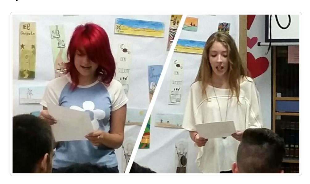
" Educational Micro-stories"