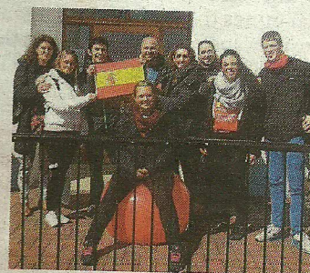
Marbella students in Kells.

Their Erasmus project, "Teaching: An effective key to self-learning", encourages students to act as teachers at the foreign schools they visit. The Marbella students focused their session in Ireland on traditional Andalusian games.