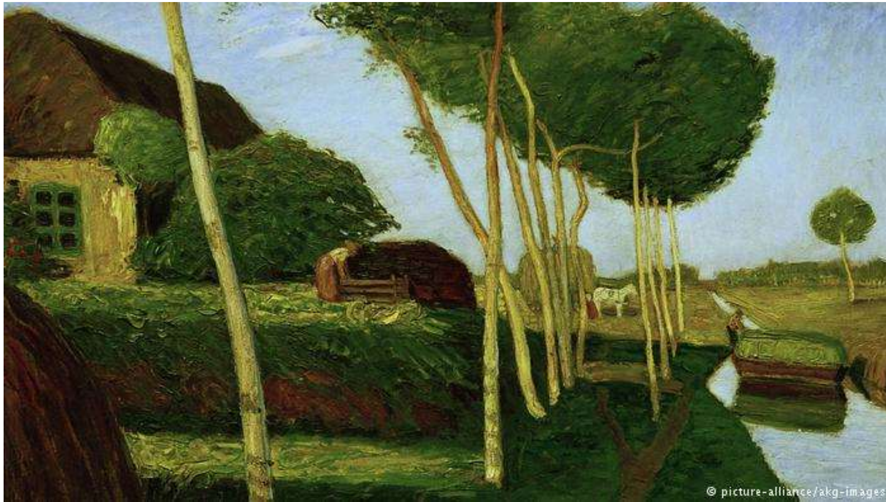
Worpswede, seen by Otto Modersohn, Paula's husband