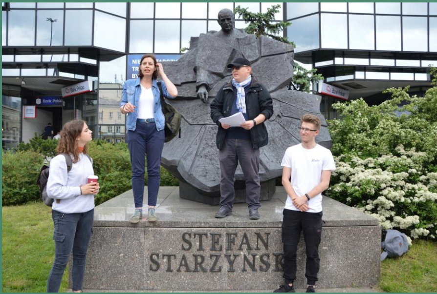
We had a city game in a Warsaw Ghetto