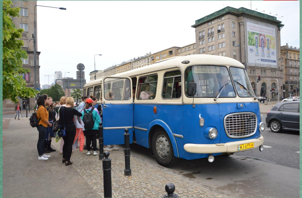
Tour of Warsaw by the old bus