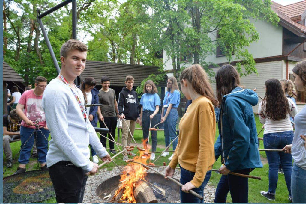
We had a bonfire