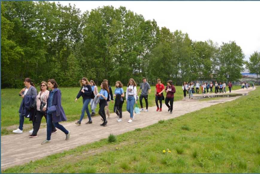
We went for a walk