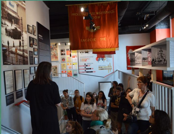
Museum of Life under communism