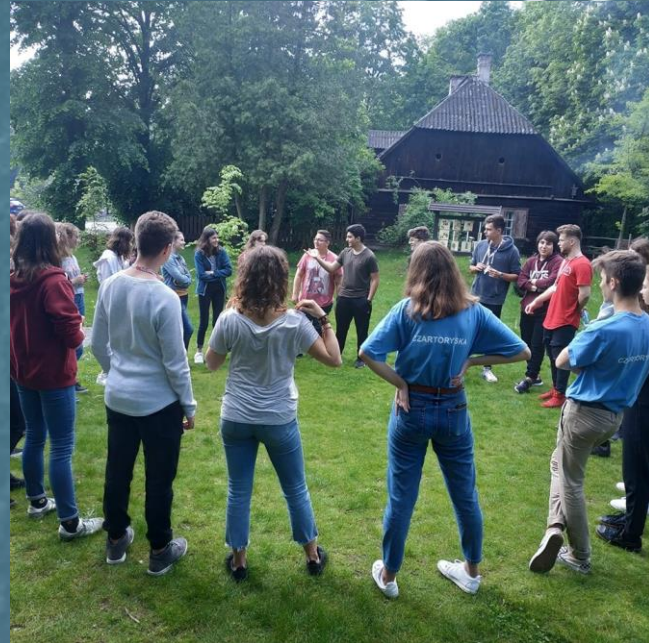
And we started to know each other