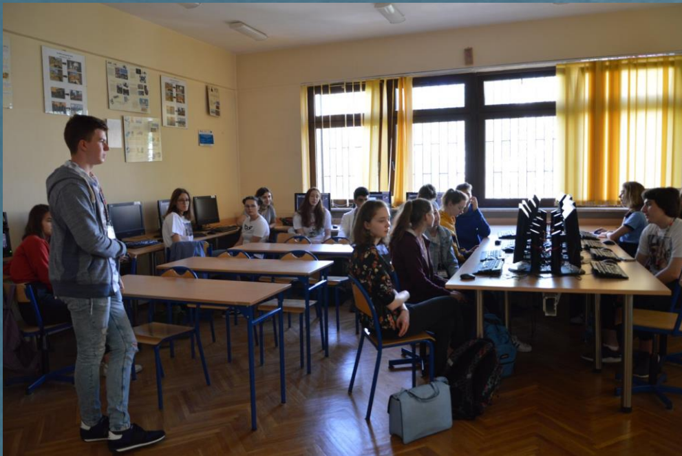
We had IT classes