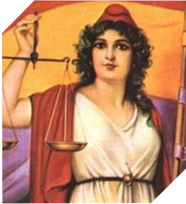
Republican and justice