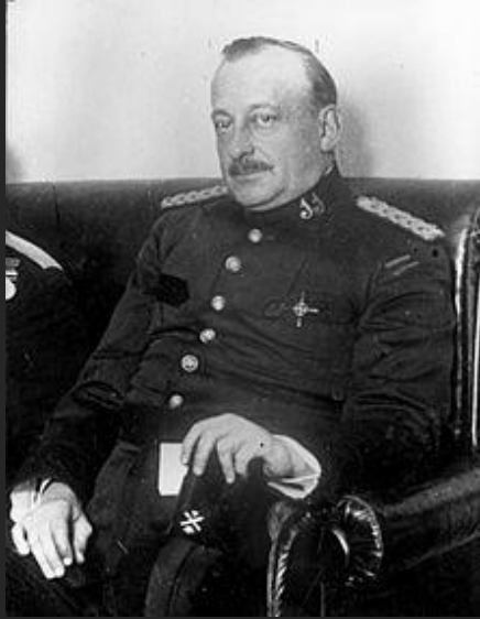
Primo de Rivera