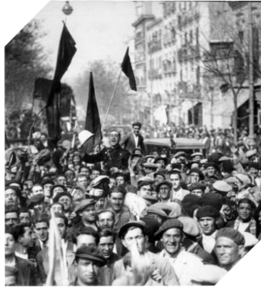
Manifestations of republican people