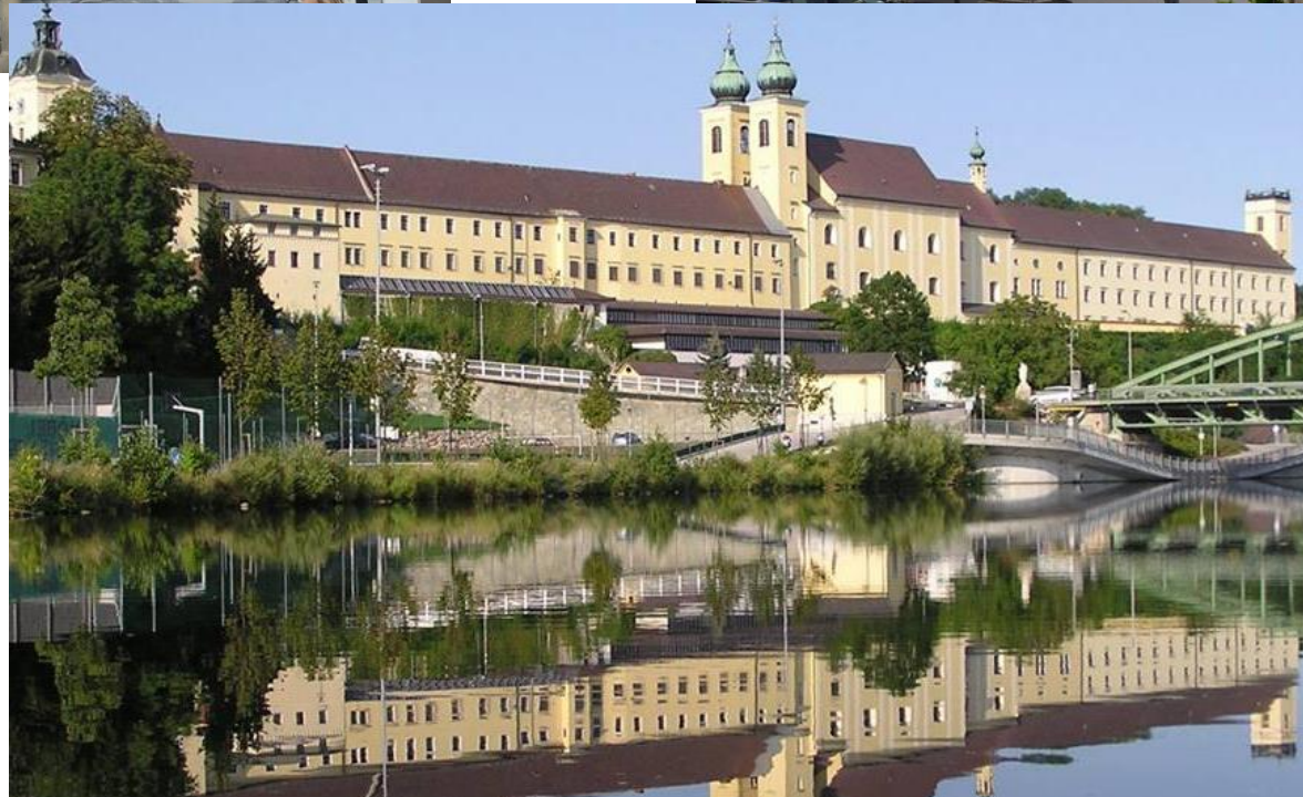
Monastery of Lambach