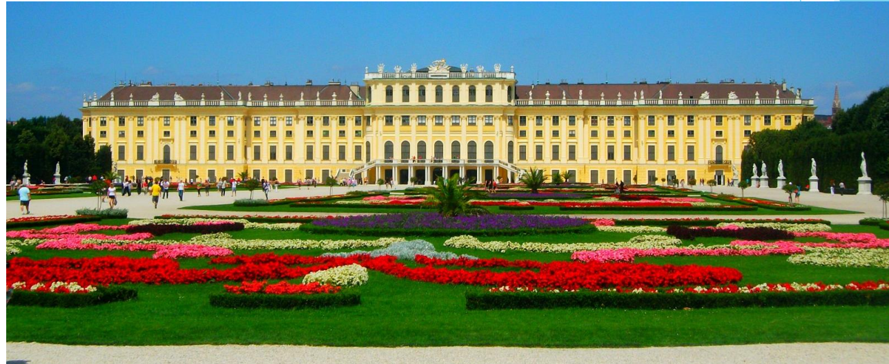
Castle of Schönbrunn