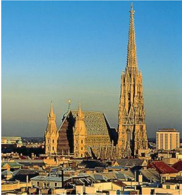
St. Stephan's Cathedral