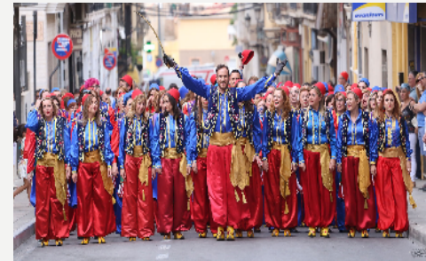
Moors and Christians