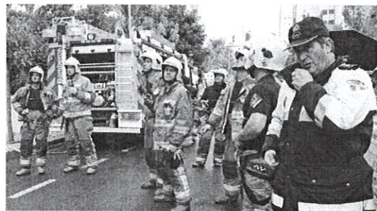
Fireman's evacuating people