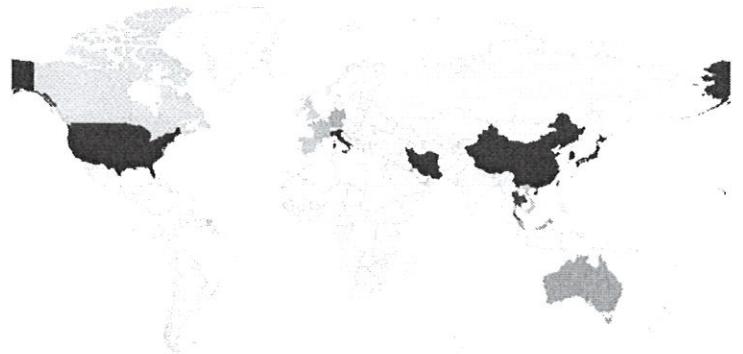
Countries affected with Coronavirus