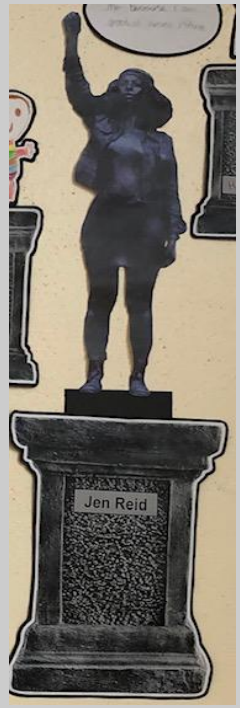
We discussed the meanings of these words