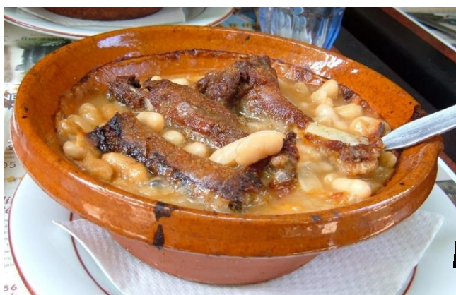
Cassoulet (a dish made with beans, sausages and preserved duck or goose)