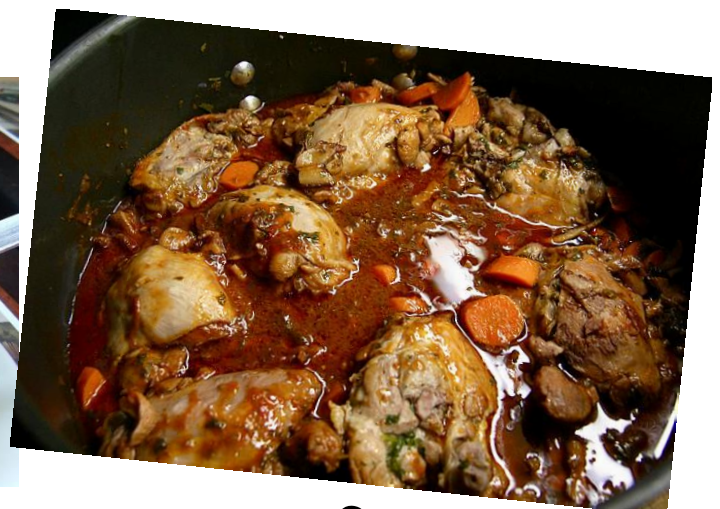
Coq au vin