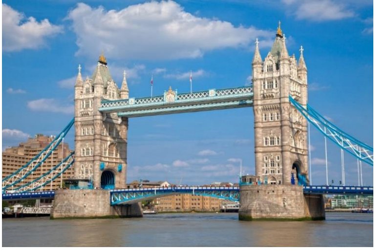
The Tower Bridge