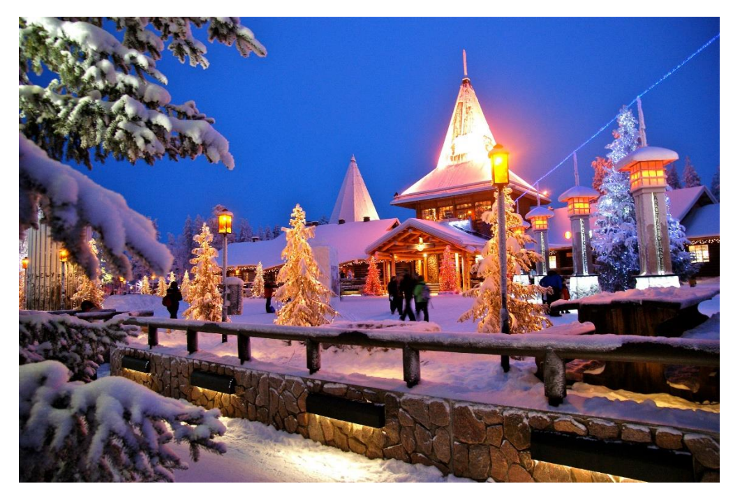
Santa Claus Village, Rovaniemi, Lapland