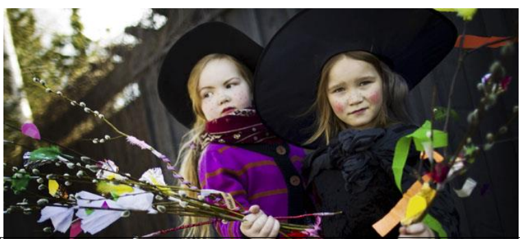
A twig for you, a treat for me!" Easter witches appear on doorsteps in Finland on Palm Sunday or Easter Saturday.

On the Sunday before Easter young Children (especially girls) dress up as Easter witches. The little witches then go from door to door, bringing willow twigs decorated with Colourful feathers and Crepe paper as blessings to drive away evil spirits, in return for treats.