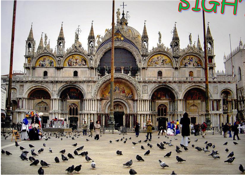
St Mark's Basilica