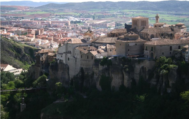
The city of Cuenca and the Hanging Houses.