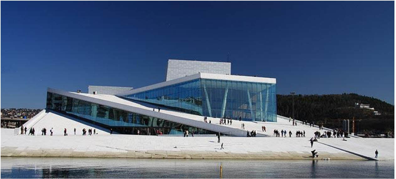
Oslo Opera House