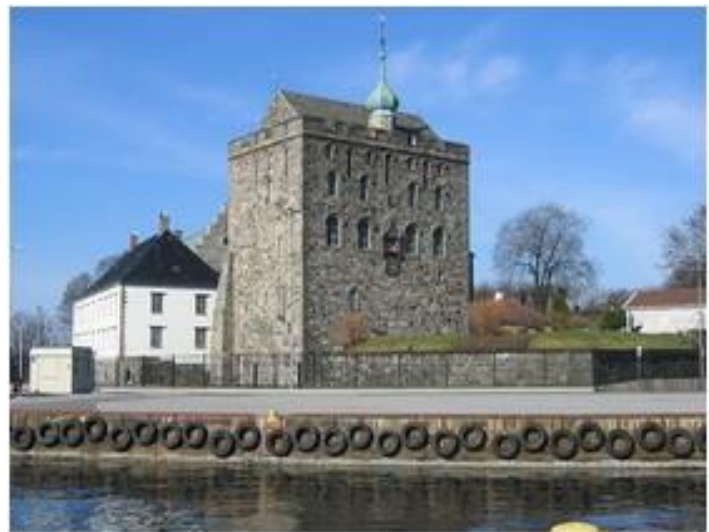
The Bergenhus fortress