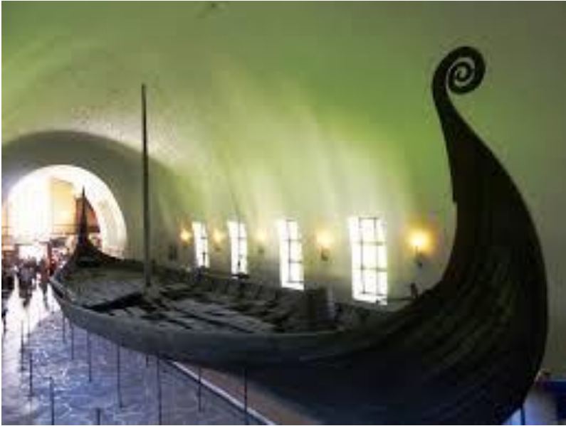
The Viking Ship Museum