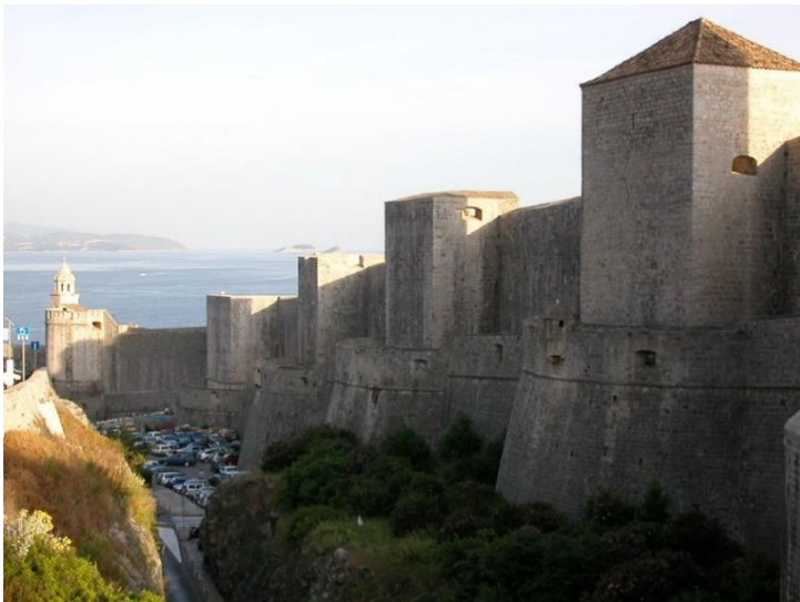
Walls of Dubrovnik

There is an old Roman Empire Arena in a city of Pula. It is about 2,000 years old. You can go inside and see where the gladiators fought. Today, concerts take place there.