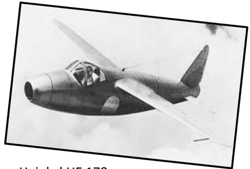
Heinkel HE 178