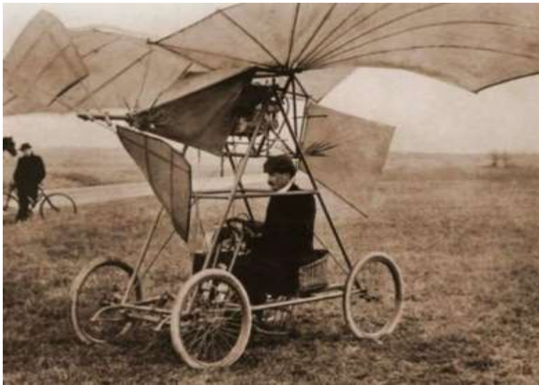
Traian Vuia and his plane.

He was the first to prove that a flying machine could rise into the air by running on wheels in 1906 .