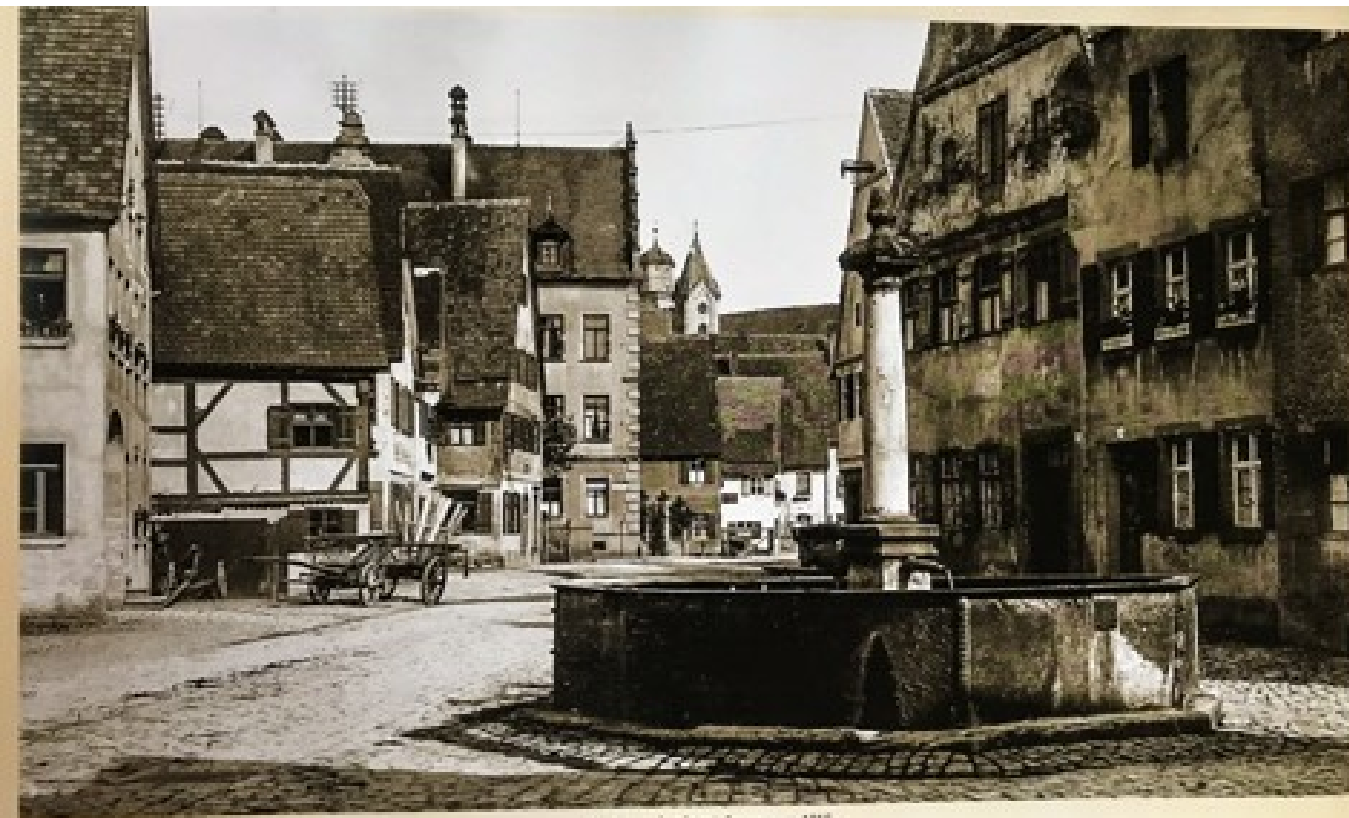
Nördlinger Straße mit Brunnen um 1915