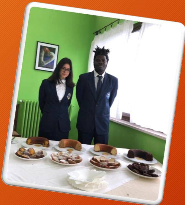
Majorana students during guidance activities