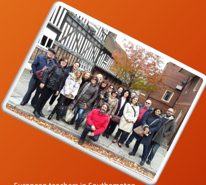
European teachers in Southampton