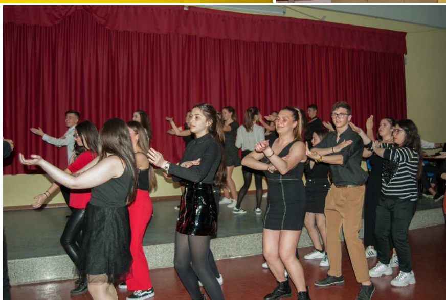
On Saturday 6 th April the guests departed accompanied by the Italian hosts.