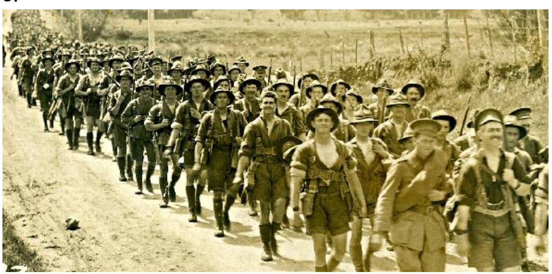
Which country made the first declaration of war?