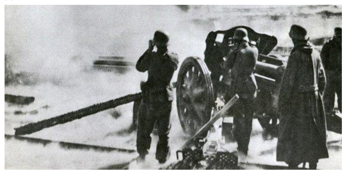
Which German attack provoked Britain to go to war?