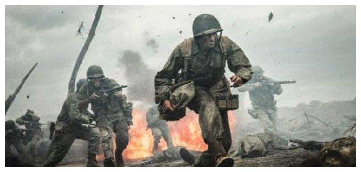
What was the area in between trenched called during WWI?