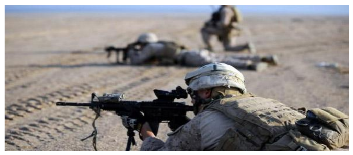
Which of the following military technologies were developed during World war one?