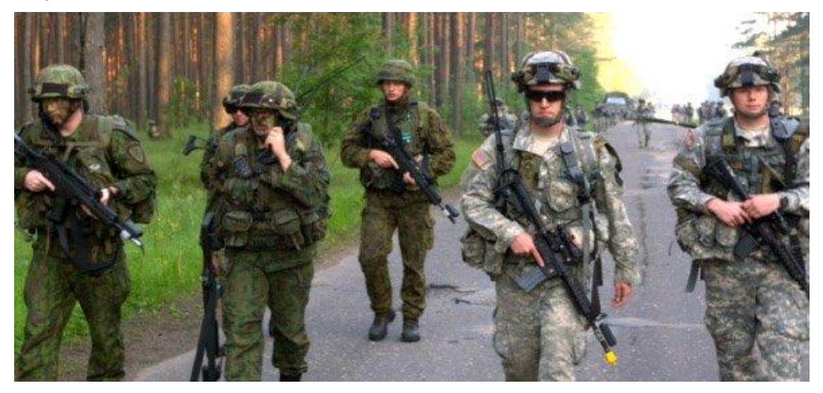
Who was the commander of U.S. forces in Europe?