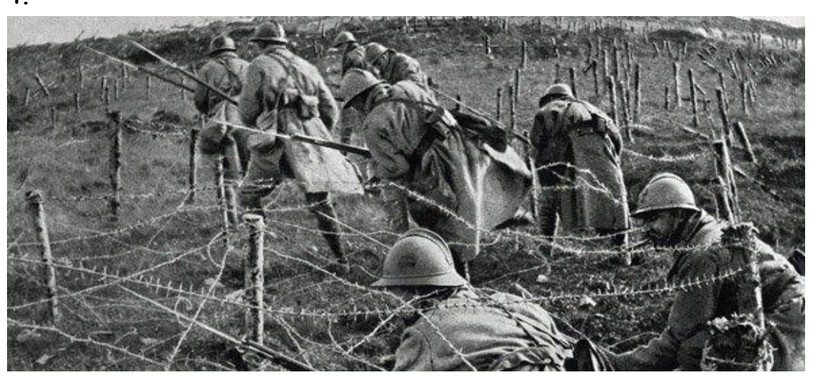
All of these were major battles of WWI except.