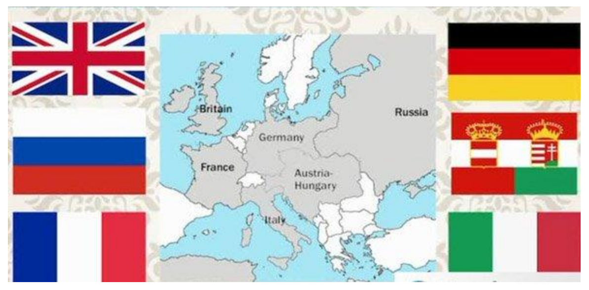
Which countries were not in the Triple Entente in 1914?