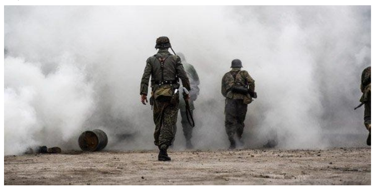
In 1918, the city of Paris suffered repeated attacks from German of