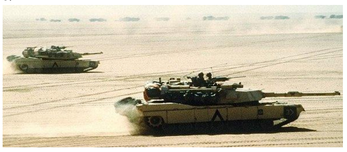
What is the maneuver warfare?