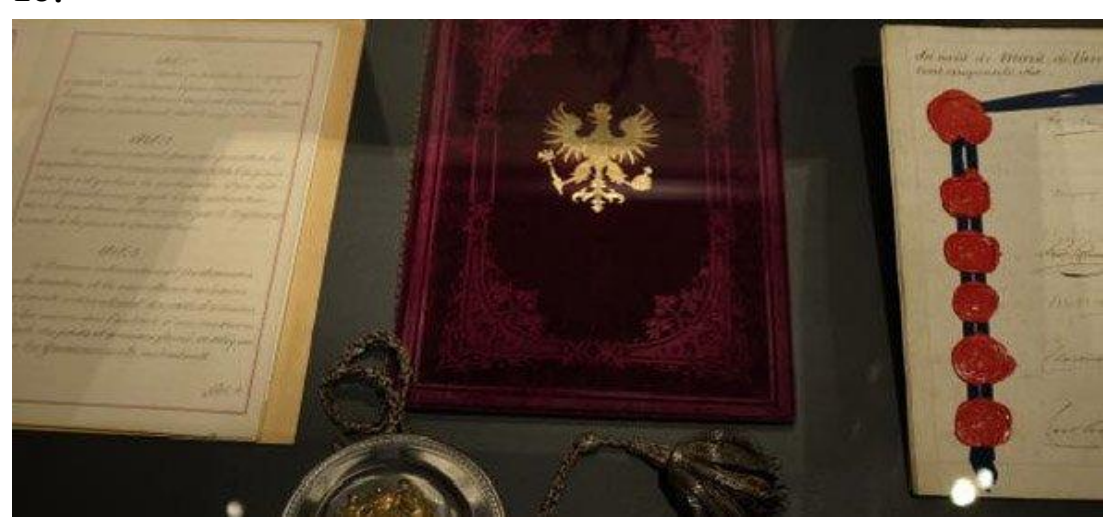
When and where was the treaty between France and Germany signed? Discuss