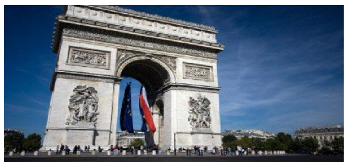
When was the Armistice between Germany and France signed?