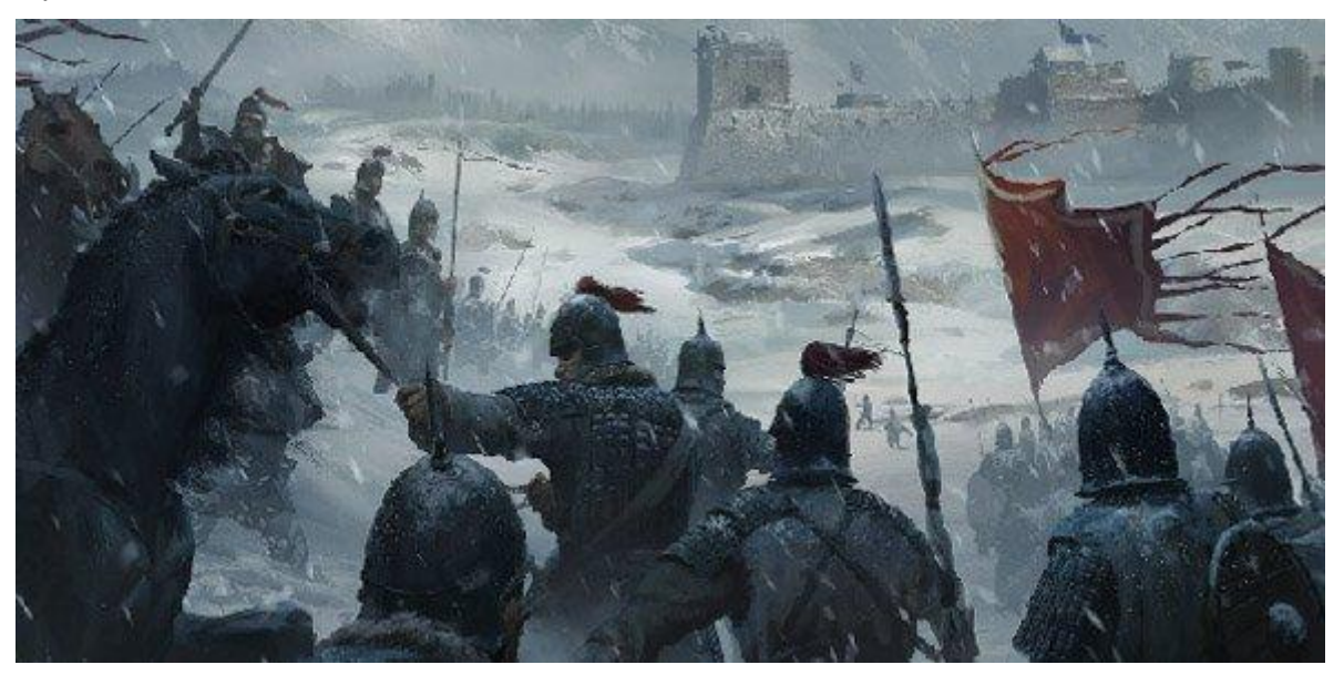
During which years did the Attrition warfare take place?