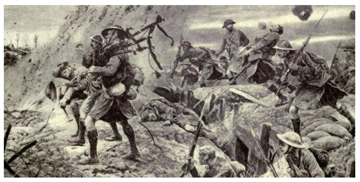
World War One is also known as...