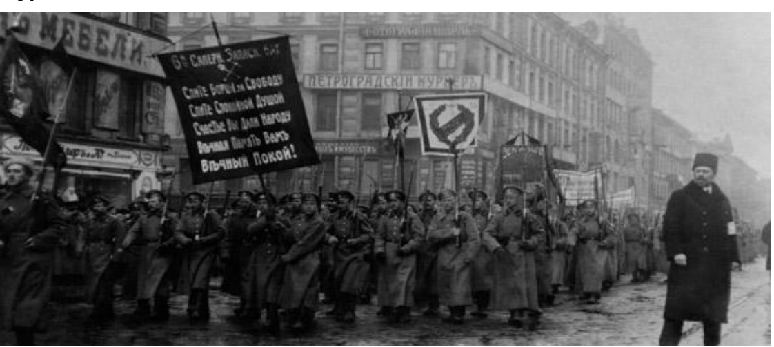
What was the Russian Revolution?