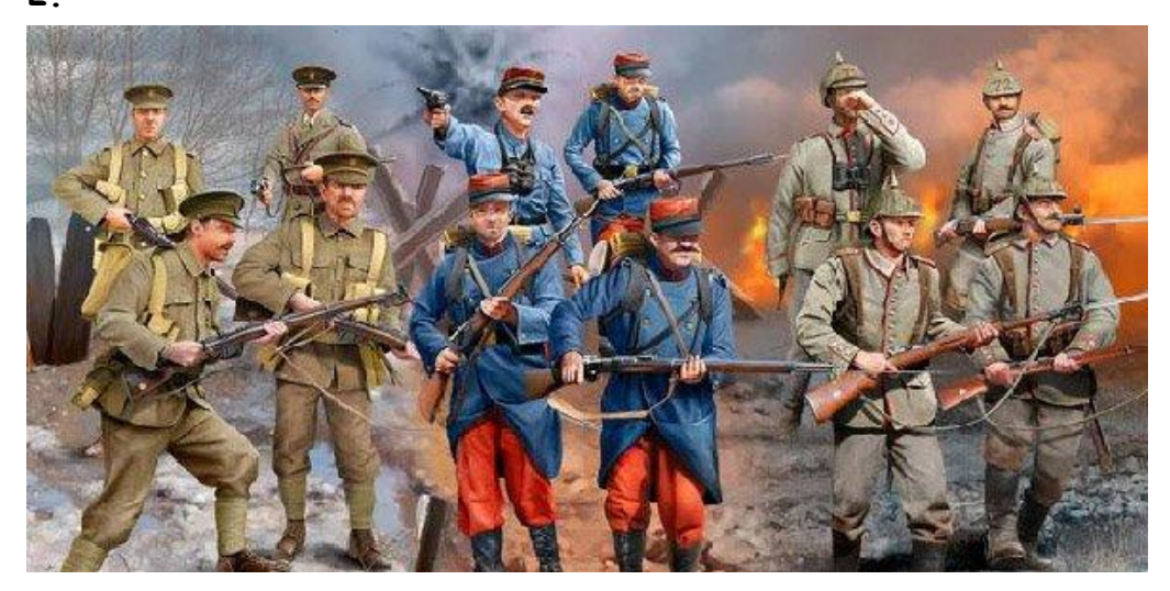
Which of the following was not a cause of WWI?