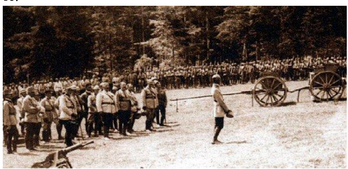
Which country joined the war on the side of the Allied Powers in 1916?