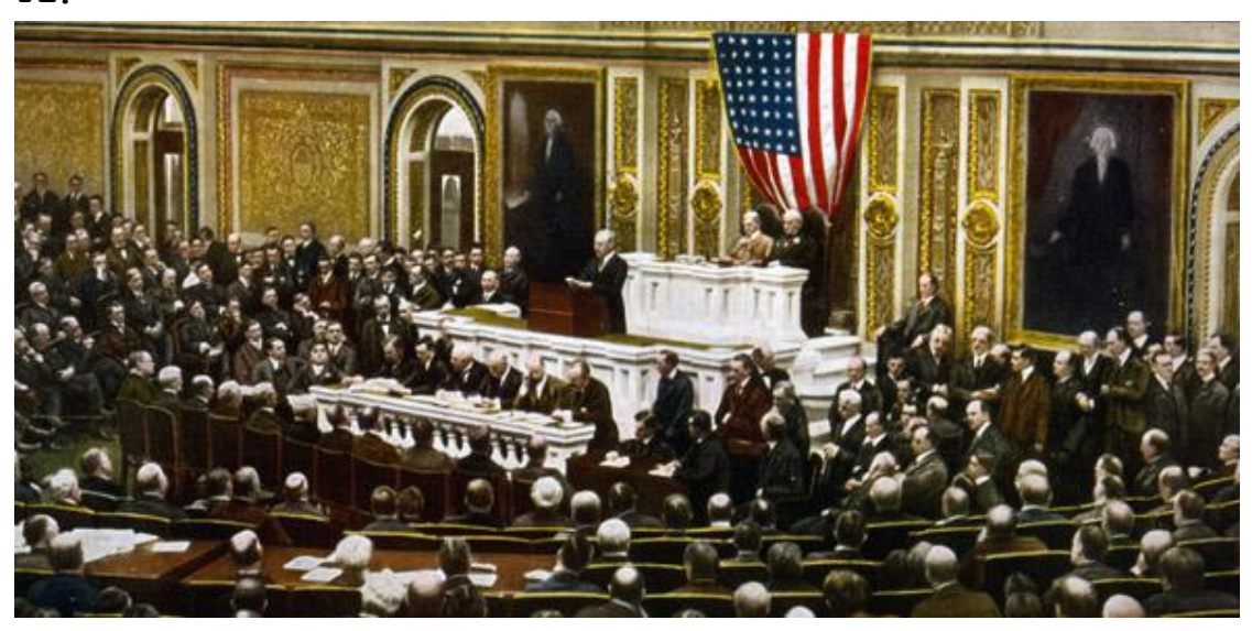
On what date did the United States declare war on Germany?