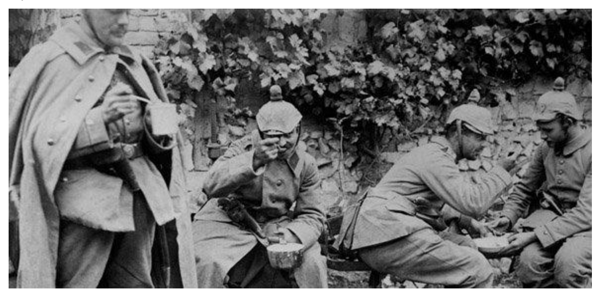
In which year did the battle of Verdun start?