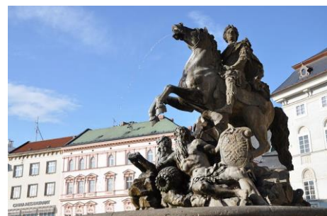
Baroque Caesar's Fountain

Speaking about architecturally significant buildings, it is definitely Baroque. The reason is that the city was almost razed to the ground during the Thirty Years' War (1618–1648), and so it had to be built completely anew just in the time when Baroque was the prevailing European style. The 17th and 18th century were also times of big religious zealotry and so it is no wonder that many religious monuments originated then, including the Basilica of the Visitation of Virgin Mary and the Holy Trinity Column.