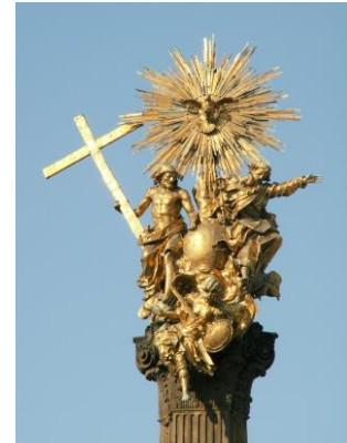
Top of the Holy Trinity Column

My favourite site is definitely the Holy Trinity Column, because its architecture is of world significance despite the fact that it was all made only by local architects and craftsmen. Nowadays there are much higher buildings in Olomouc, but I imagine that in the time of its completion it must have been very a splendid look at Olomouc from the distance with the column erecting above all its houses and palaces and with its gold-plated group of statues on the top, reflecting the sun rays far into the surroundings.