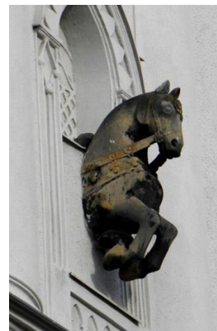
House sign of the Palace at the Black Horse

However, not only famous architectural monuments have their legends, there are many connected also with some minor sights, such as the one of the so called Palace at the Black Horse. In the past the houses did not have their street numbers, they had house signs instead, and the sign of this palace, standing in the Lower Square ( Dolní náměstí ) inspired the following humourous folk legend: A rich family used to live in the palace and one of their female servants fell in love with the son of the lord. She visited a herbalist who gave her a recipe for a love potion that the young man was supposed to drink. So she cooked it, but after she put it out to let it cool, another servant turned it over by accident and the potion was spilled into a bucket of water, which was given to a horse. As a result, the horse fell into so strong love with the girl that it pursued her everywhere. The desperate maid finally jumped out of the window and killed herself. The horse tried to jump after her, but got stuck in the window and has stayed there, turned into stone, until nowadays.