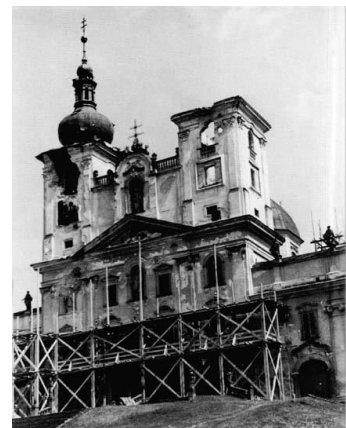
Church of the Visitation of Virgin Mary after Russian bombardment in 1945

The Holy Trinity Column survived all the historical events which have passed through Olomouc well and so its main enemy is the time itself along with all the natural elements like rain or frost. The largest renovation was done between 1999 and 2001, after it was found out that some of its sculptural decoration may collapse. Since that time it has been under detailed observation and its condition is stabilized.