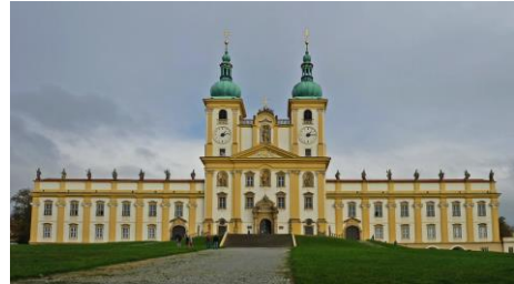
Church of the Visitation of Virgin Mary

is absolutely the most important monument in Olomouc, whose significance is also underlined by the fact that it is the only historical sight in our region which was put on the UNESCO World Heritage Sites List. Another one is the Church of the Visitation of Virgin Mary on the east edge of the city on a hill called Svatý Kopeček (which can be translated into English as the Holy Hill). The church was promoted the so called Basilica Minor, mainly because of its rich history and its significance as a pilgrimage destination.