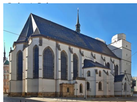
Saint Moritz Church