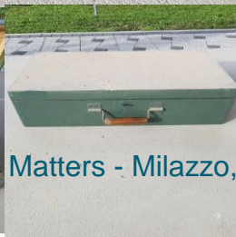
Erasmus+ Migration Matters - Milazzo, Sicily December 2017