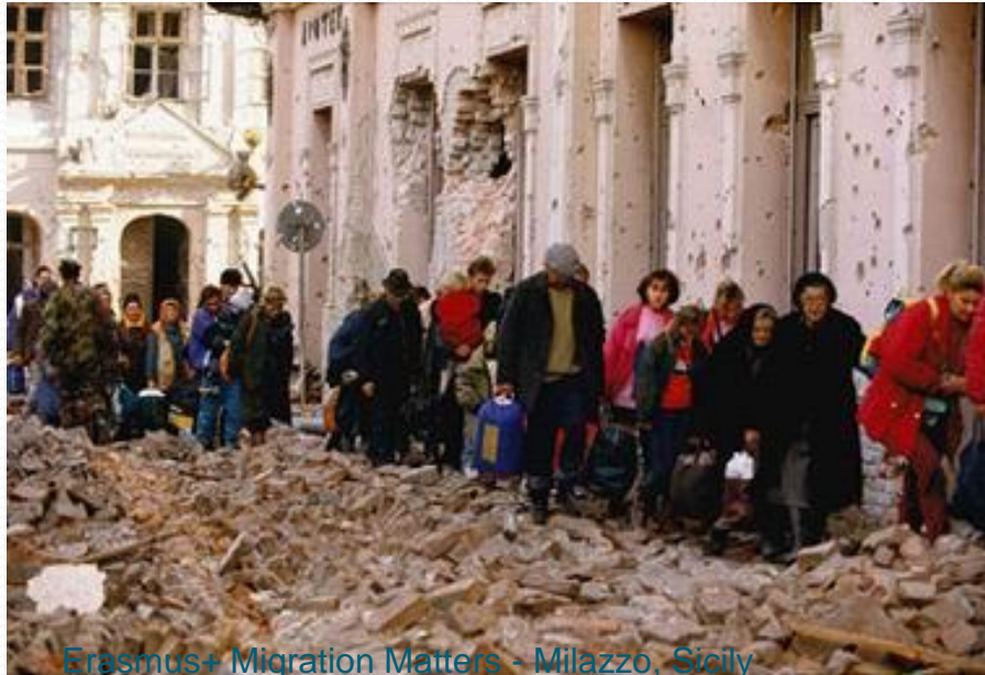
Erasmus+ Migration Matters - Milazzo, Sicily December 2017