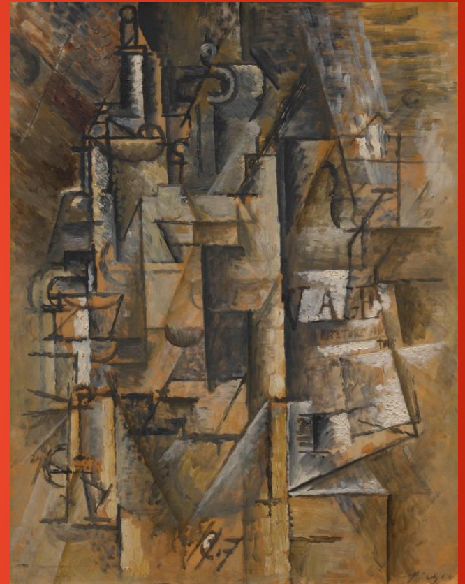
Pablo Picasso « Bouteilles et verres » - Cubism, 1911-1912

Picasso died April 8th, 1973 in Mougins, France, at the age of 91.