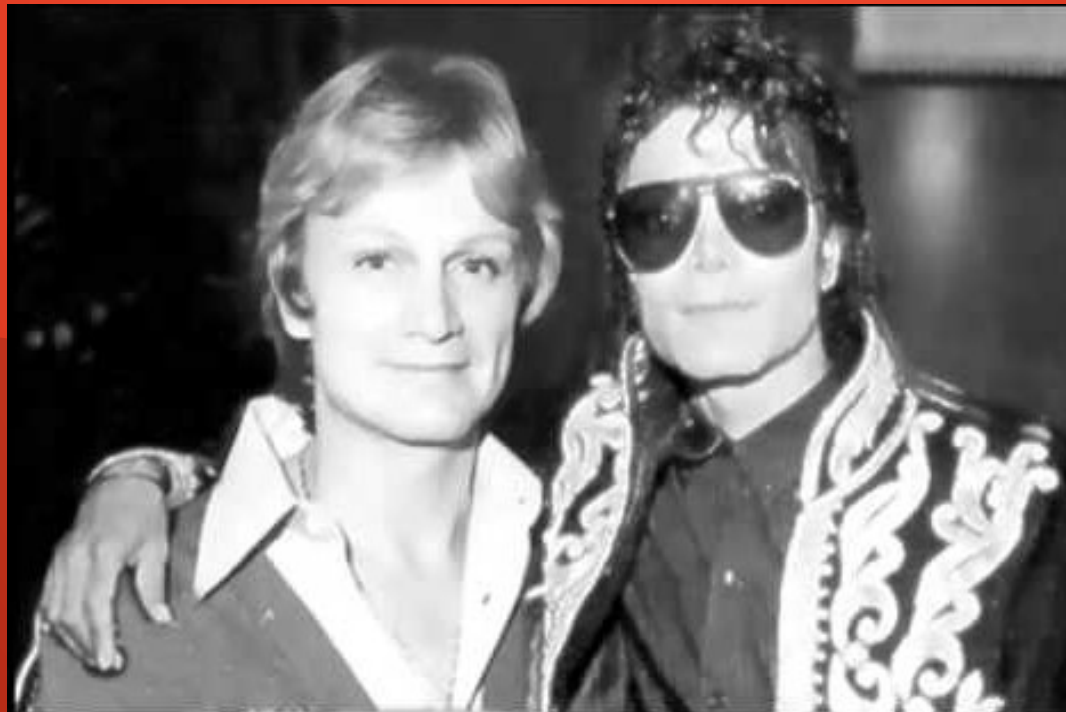
Photography of Claude François with Michael Jackson, another famous singer.

Claude François died in 1978, the year he recorded “Alexandrie Alexandra”, in Paris. He got electrocuted while he was having a bath.