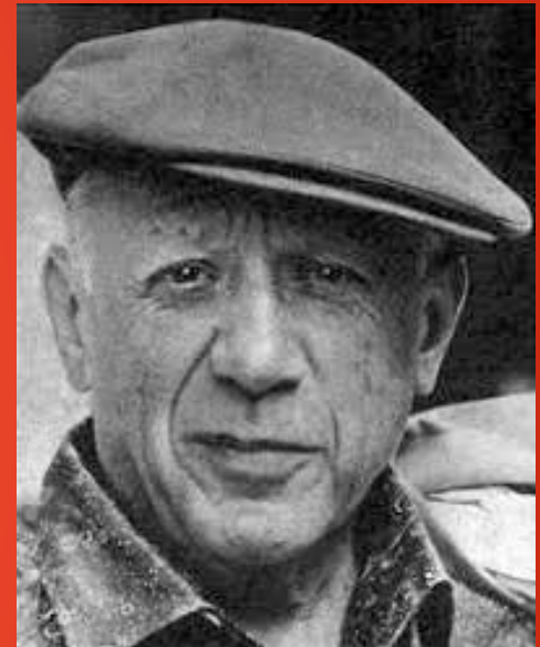
Pablo Picasso, wearing the French beret

Then, at the beginning of the 20th century he moved to Paris.