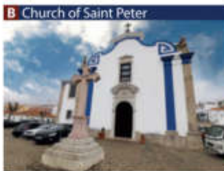
B Church of Saint Peter