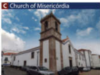
C Church of Misericórdia