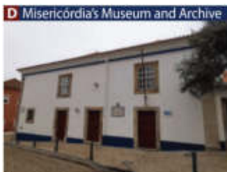
D Misericórdia's Museum and Archive