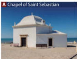
A Chapel of Saint Sebastian