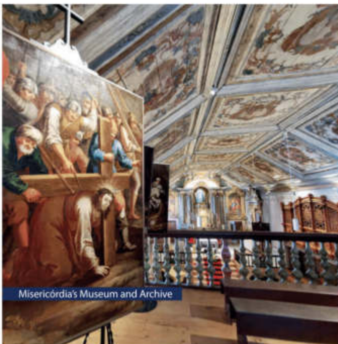
Misericórdia's Museum and Archive