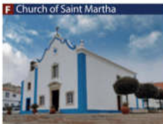
F Church of Saint Martha