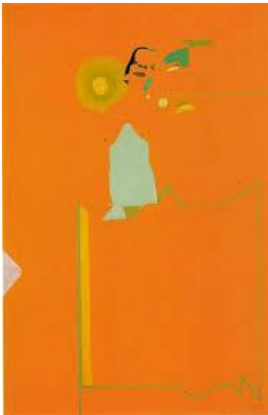
Graça Lobo, Laranja