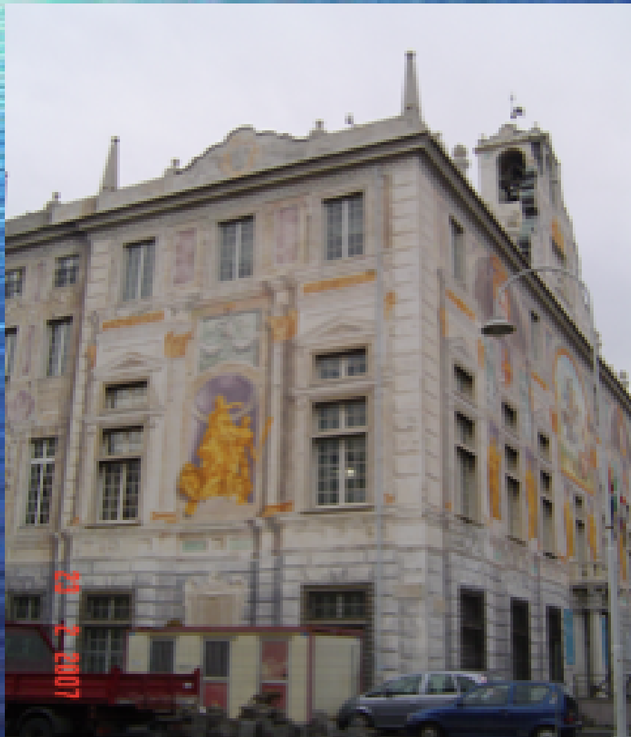
Palazzo San Giorgio