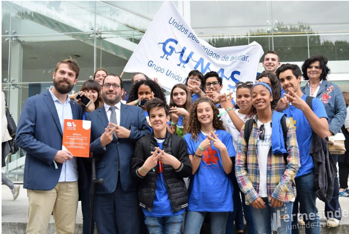
Secretary of State for Education and Vice President at the Parish Council of Ermesinde with the GUNAS in Lisbon